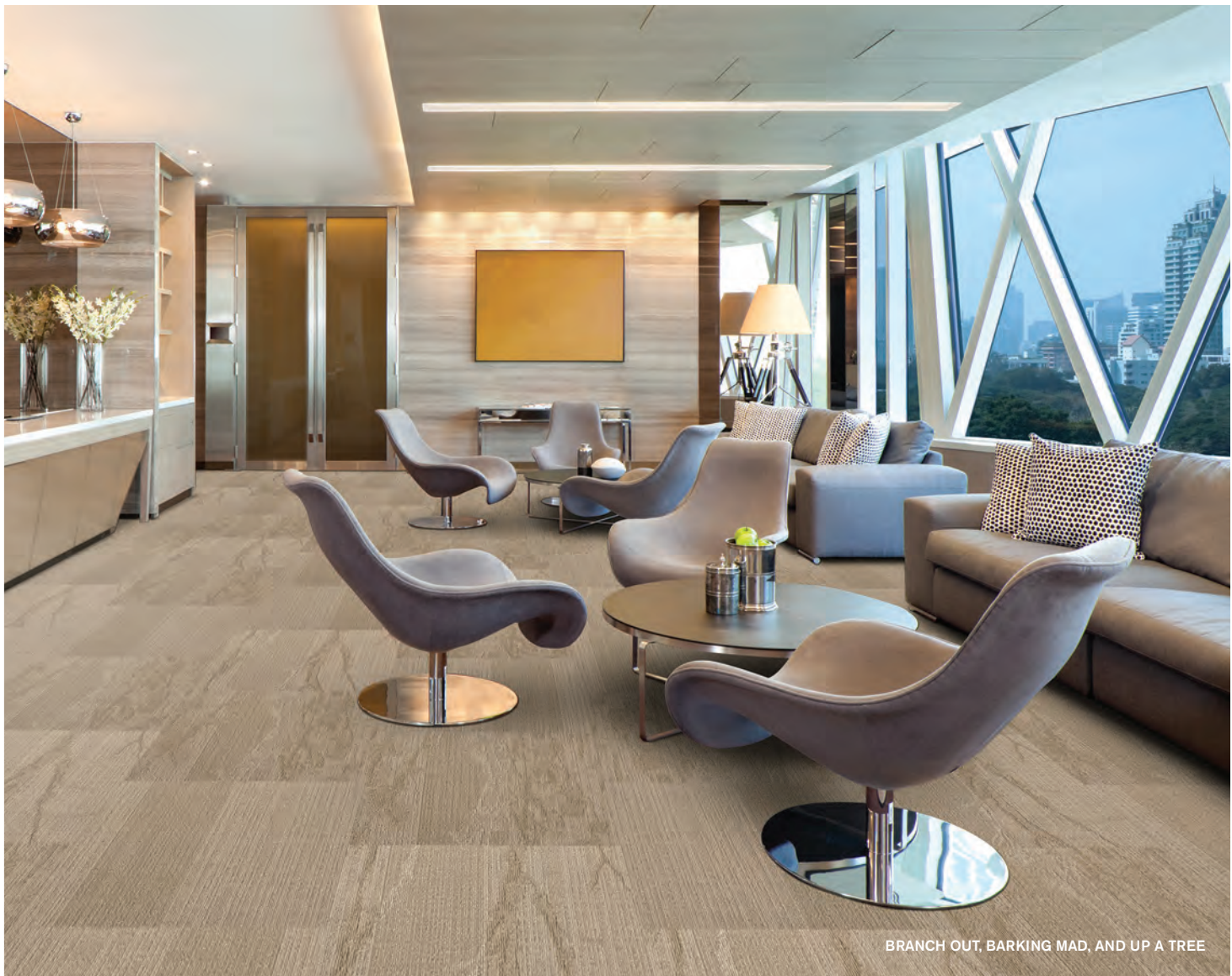
BRANCH OUT, BARKING MAD, AND UP A TREE