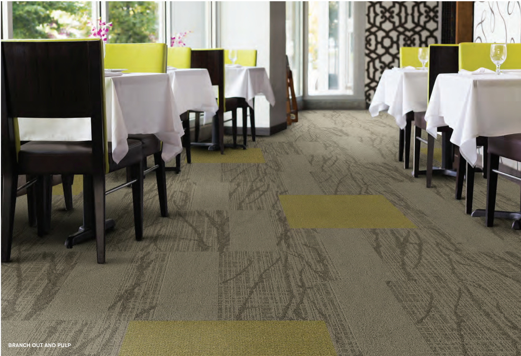
BRANCH OUT AND PULP