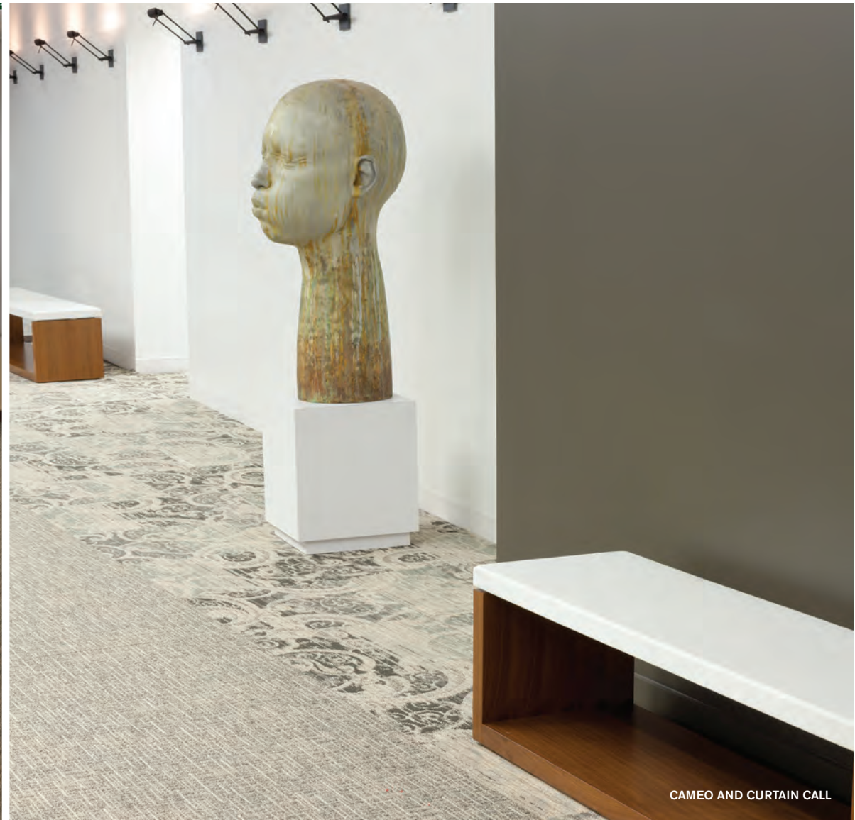
CAMEO AND CURTAIN CALL