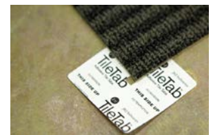
A.3 "THIS SIDE UP" facing up