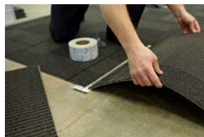
B.1 Position the next module