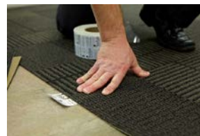
B.2 Press it into place