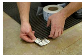
A.2 Place under the module