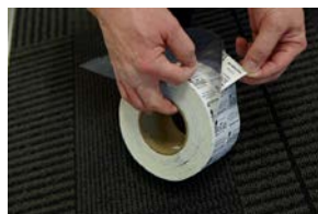
A.1 Peel the TileTab from the roll

C) Continue laying modules and TileTabs at the intersections of the module corners. Apply TileTabs at edges of modules. (See "C" diagrams.)