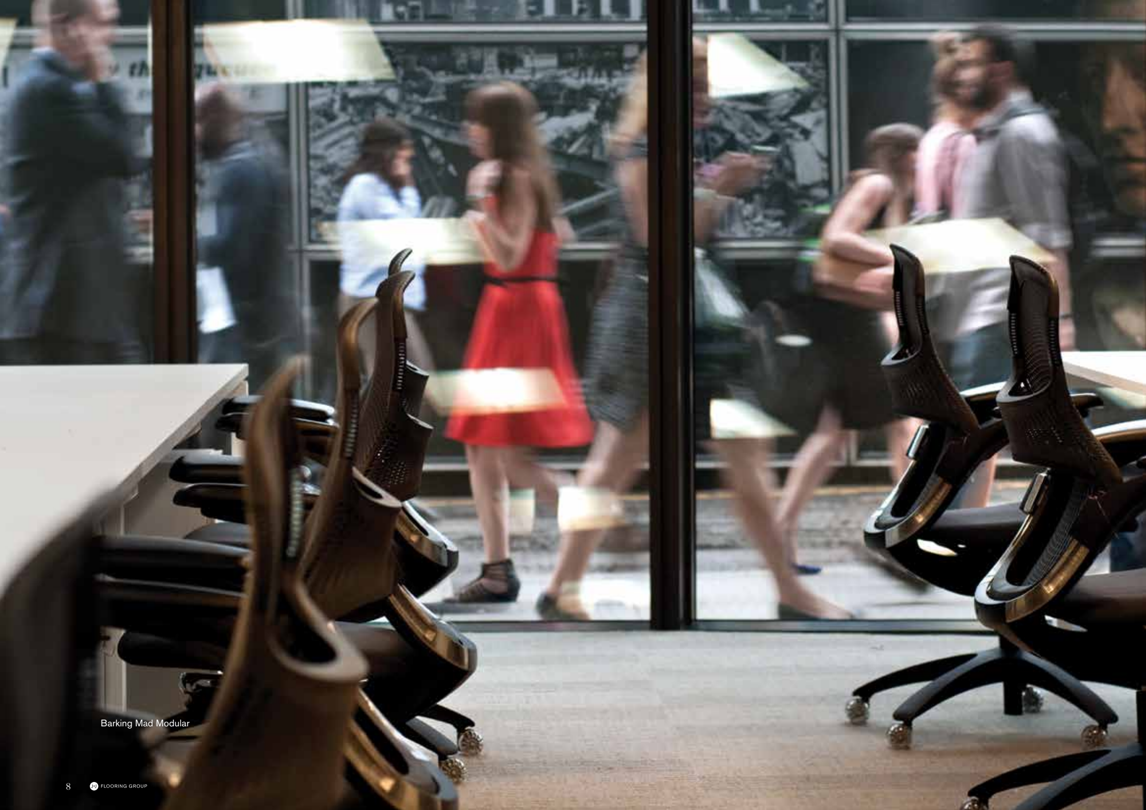
Barking Mad Modular