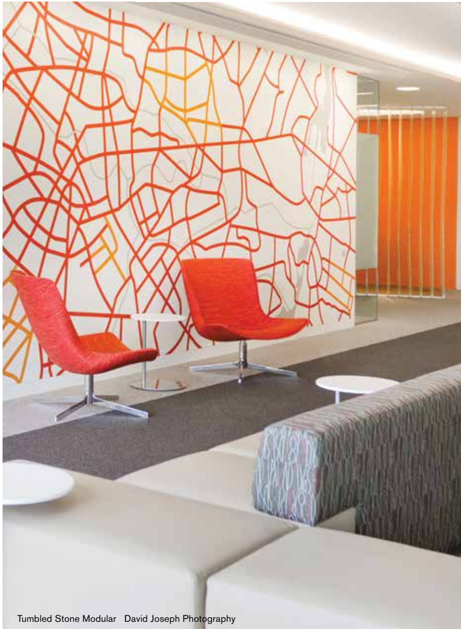
Tumbled Stone Modular