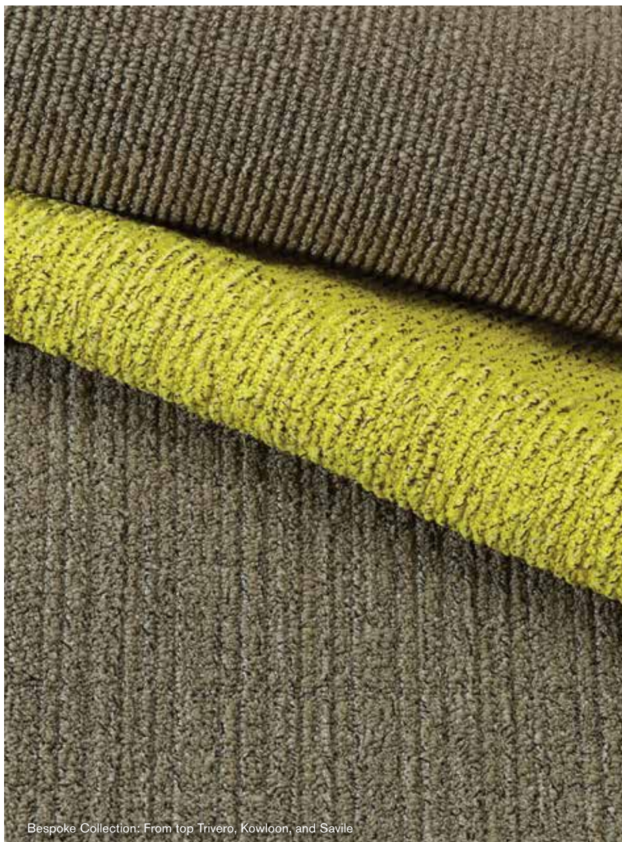
Bespoke Collection: From top Trivero, Kowloon, and Savile