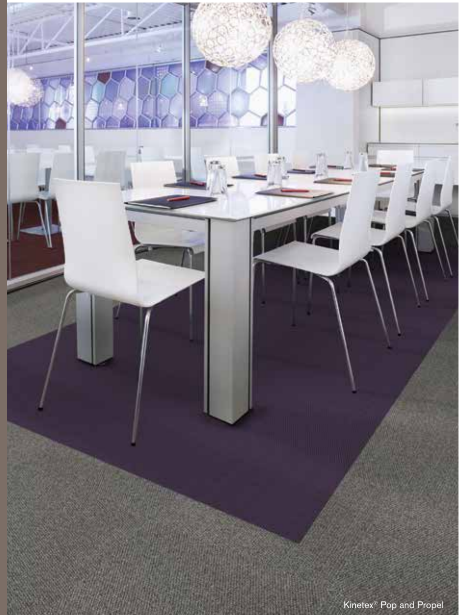
Kinetex® Pop and Propel

Included on most space dyed products – ColorLoc Plus is bleach and stain resistant and provides a Lifetime Performance Warranty