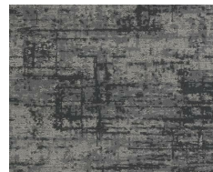
2262 Neutral De..