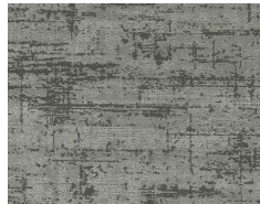
2261 Haze Grey