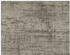
2255 Warm To...