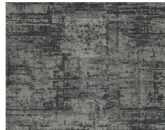
2262 Neutral De...