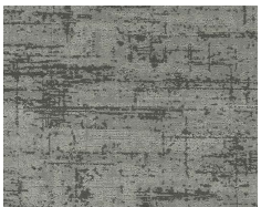
2261 Haze Grey