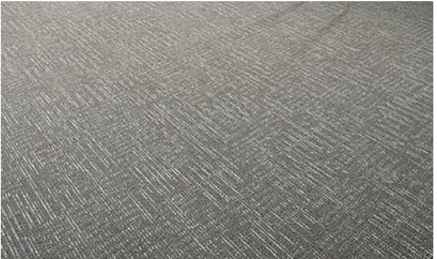
city blocks iii