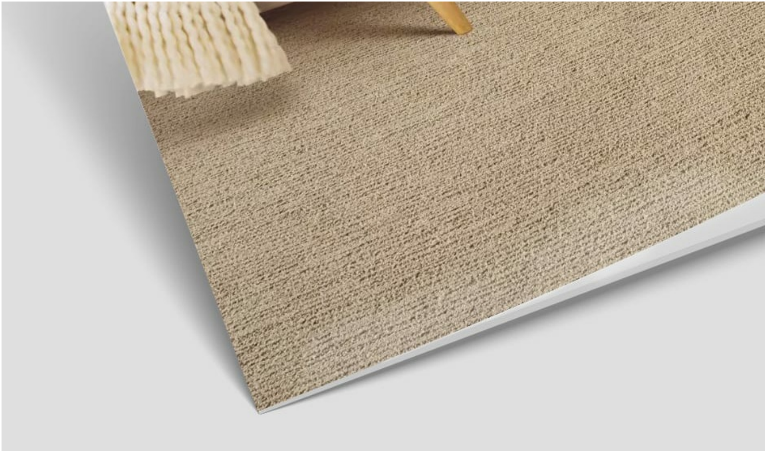
living spaces series brochure