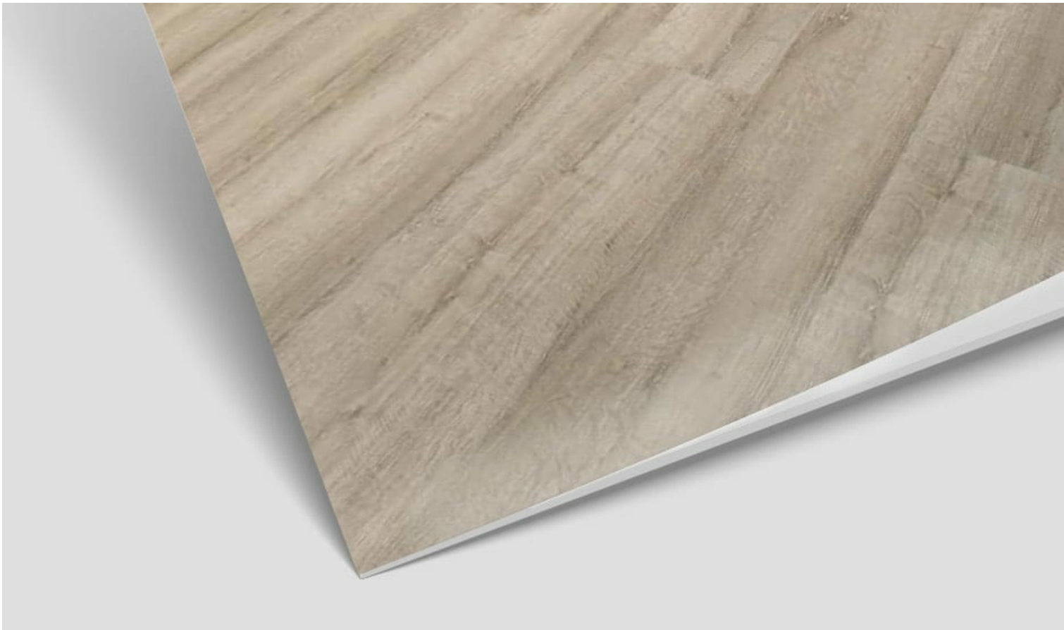
classics ii brochure