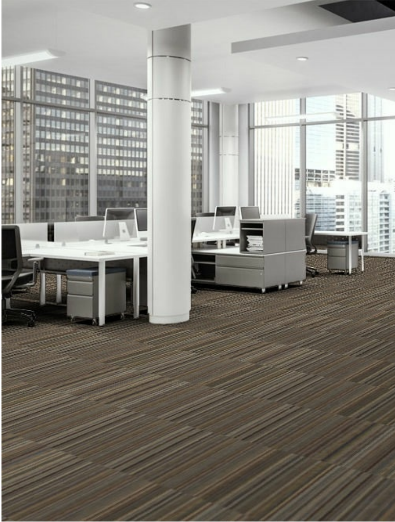
Installation Methods: Brick, Ashlar, Quarter Turn