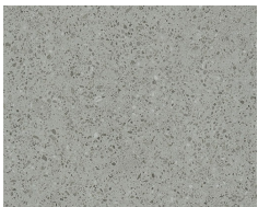
1139 Sneak Peek