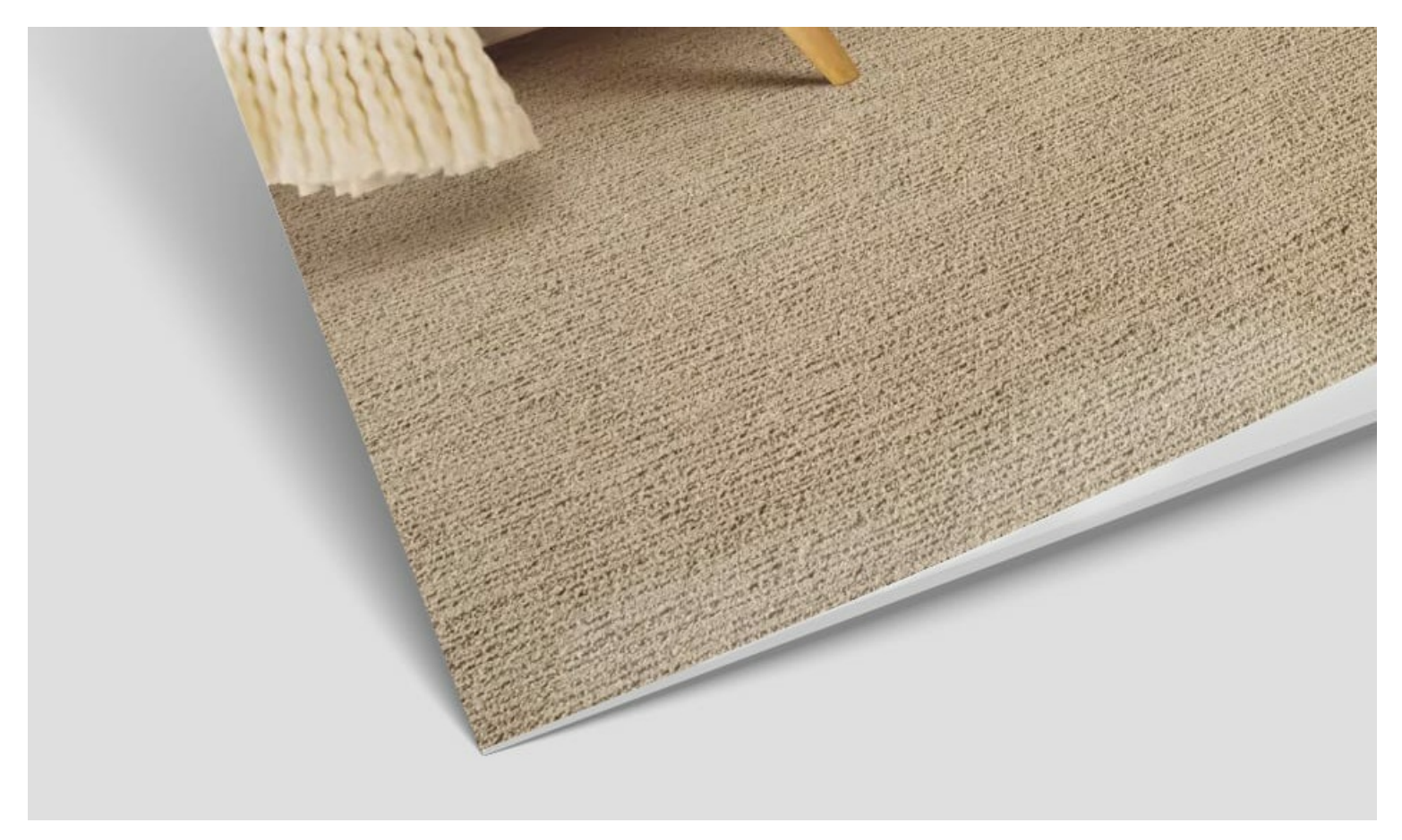
living spaces series brochure

Product specifications are based on averages derived from the manufacturing processes at within normal industry tolerances. Components may be changed without notice due to raw shortages and/or technological advances. Such variances are typical to a manufacturing primpact performance.