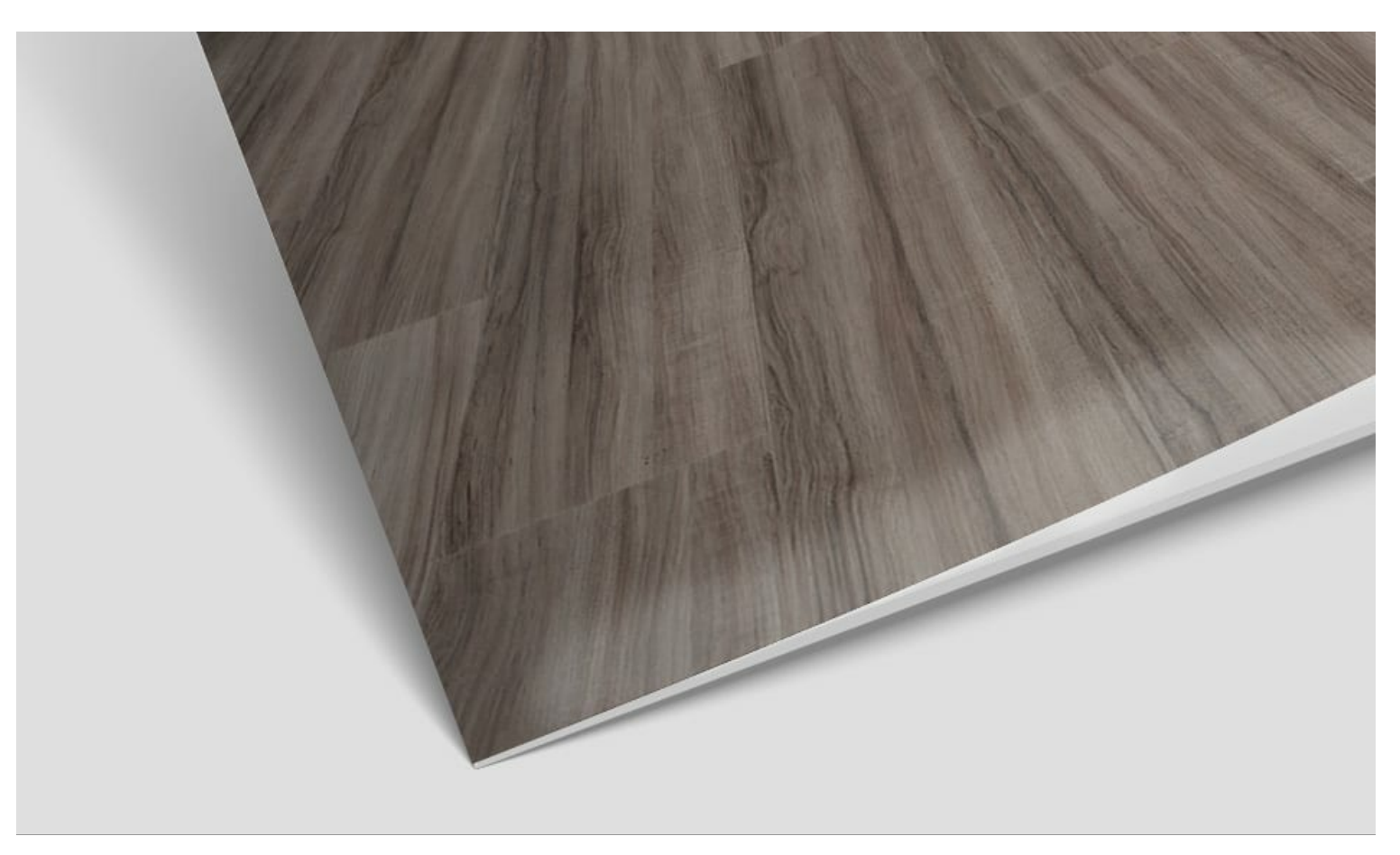
signature ii brochure