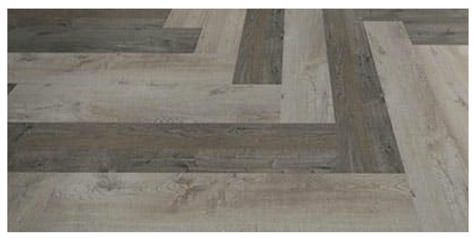
signature + signature ii