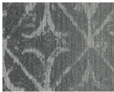
3229 Soft Grey