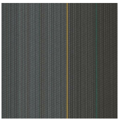
1787 Opaque Stripe