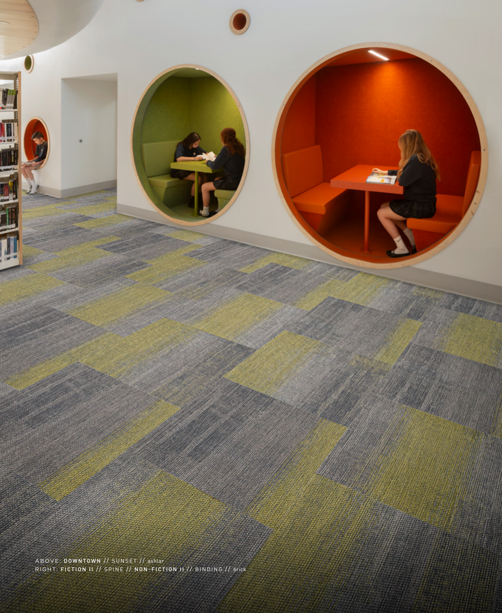
ABOVE: DOWNTOWN // SUNSET // ashlar RIGHT: FICTION II // SPINE // NON-FICTION II // BINDING // brick