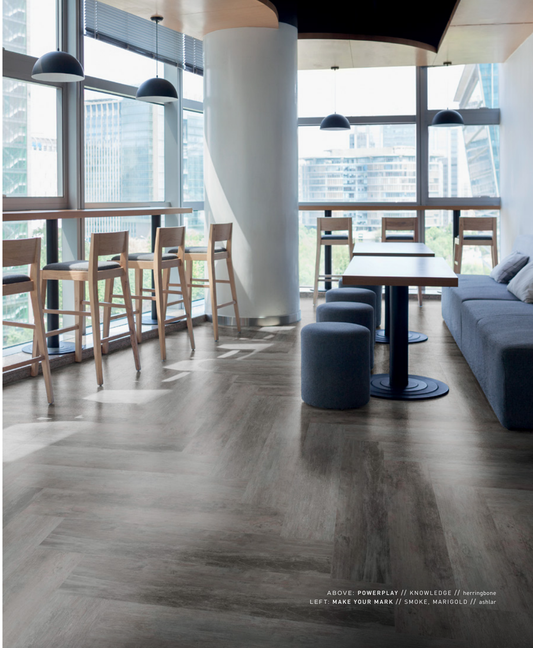
ABOVE: POWERPLAY // KNOWLEDGE // herringbone LEFT: MAKE YOUR MARK // SMOKE, MARIGOLD // ashlar