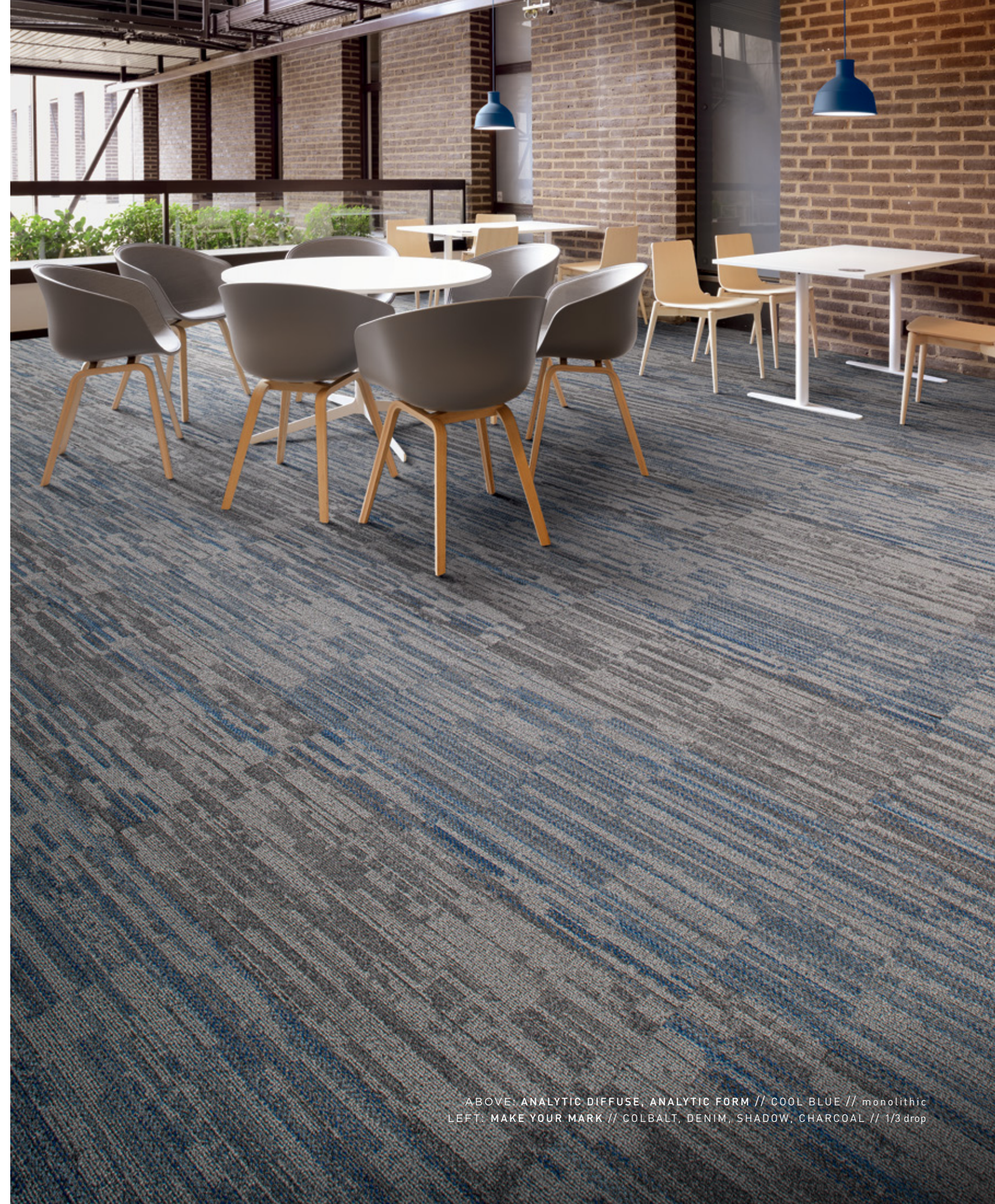
ABOVE: ANALYTIC DIFFUSE, ANALYTIC FORM // COOL BLUE // monolithic LEFT: MAKE YOUR MARK // COLBALT, DENIM, SHADOW, CHARCOAL // 1/3 drop