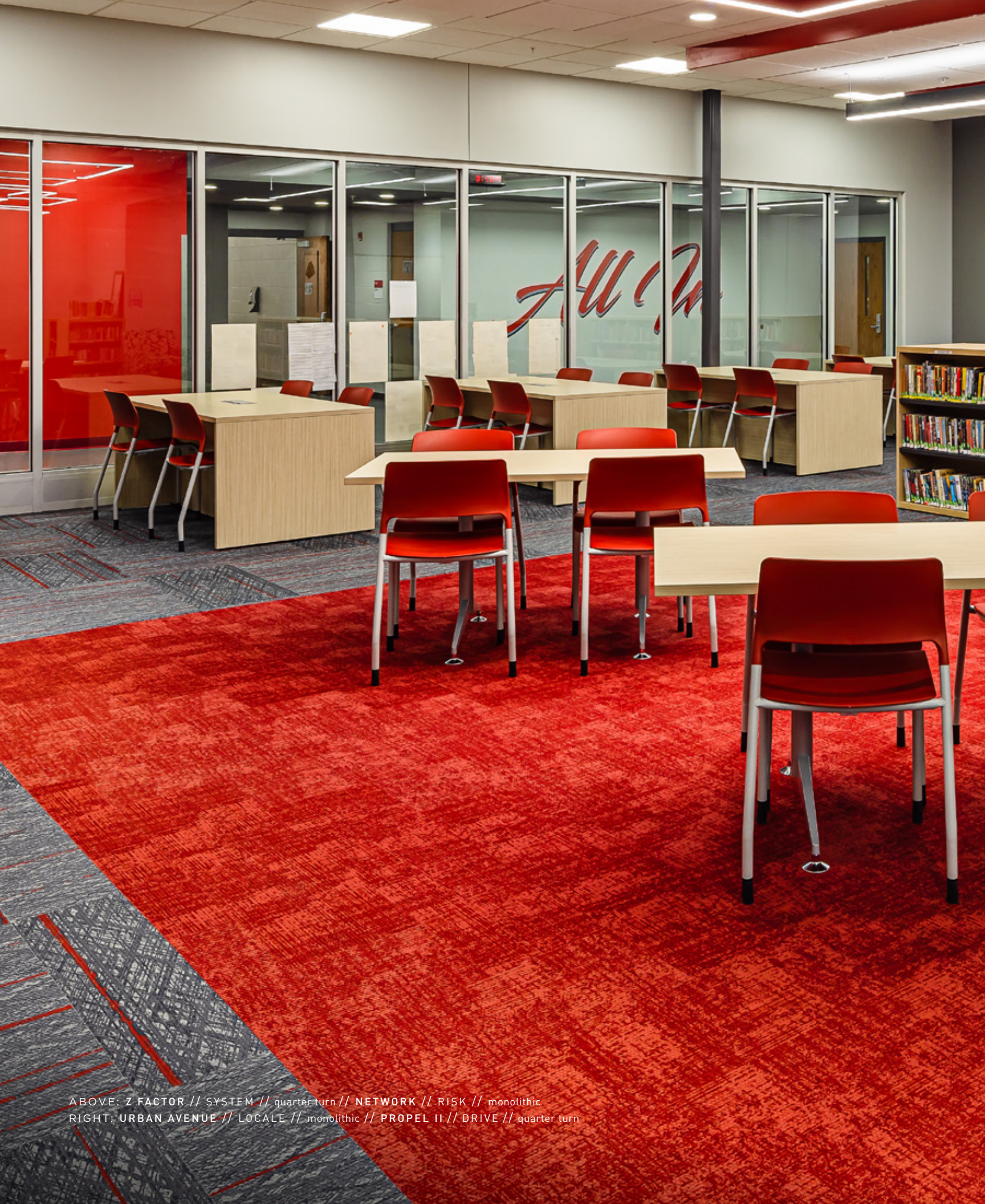
ABOVE: Z FACTOR // SYSTEM // quarter turn // NETWORK // RISK // monolithic RIGHT: URBAN AVENUE // LOCALE // monolithic // PROPEL II // DRIVE // quarter turn