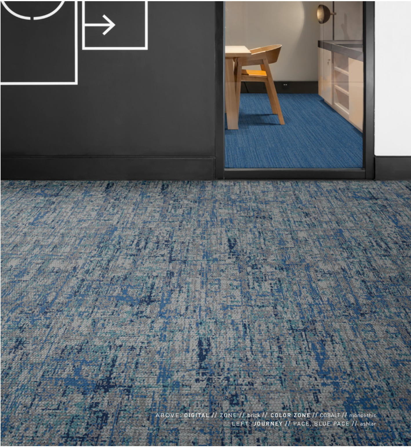
ABOVE: DIGITAL // ZONE // brick // COLOR ZONE // COBALT // monolithic LEFT: JOURNEY // PACE, BLUE PACE // ashlar