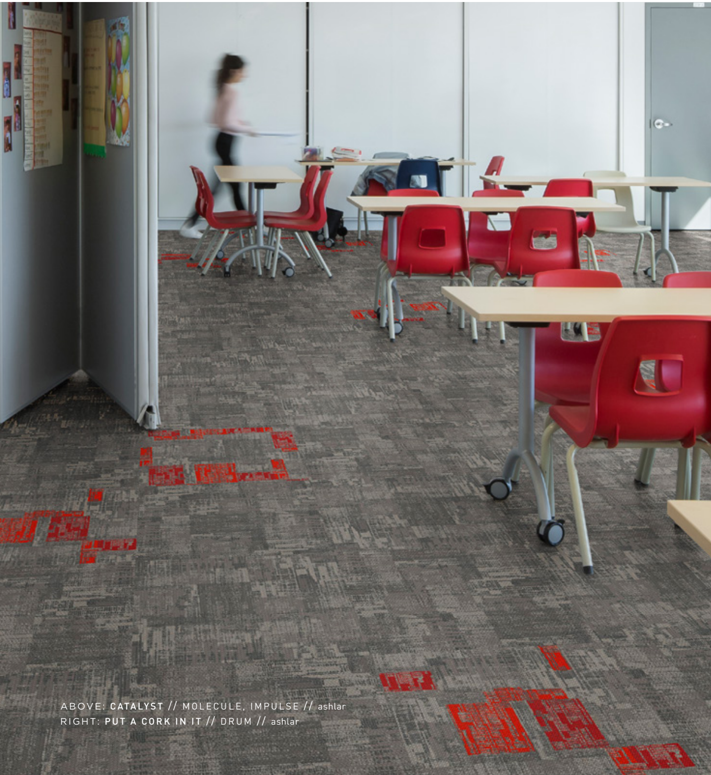
ABOVE: CATALYST // MOLECULE, IMPULSE // ashlar RIGHT: PUT A CORK IN IT // DRUM // ashlar