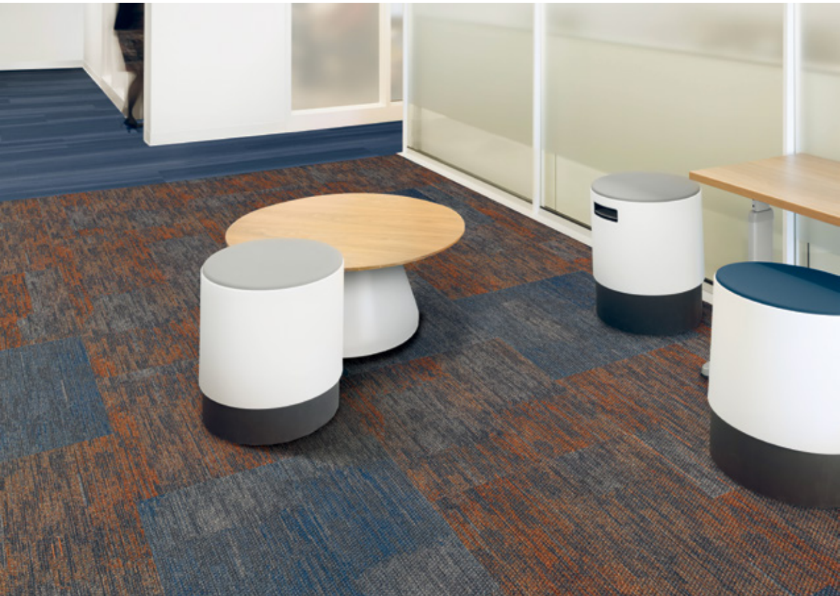
ABOVE: BOUCLÉ // WARP // ashlar TOP RIGHT: ADAPT // CARBON PATH, ADJUST, ROYAL PATH // herringbone // MAKE YOUR MARK // COBALT // ashlar BOTTOM RIGHT: GAME CHANGER // FREE, TWIST // MAKE YOUR MARK // DENIM // ashlar