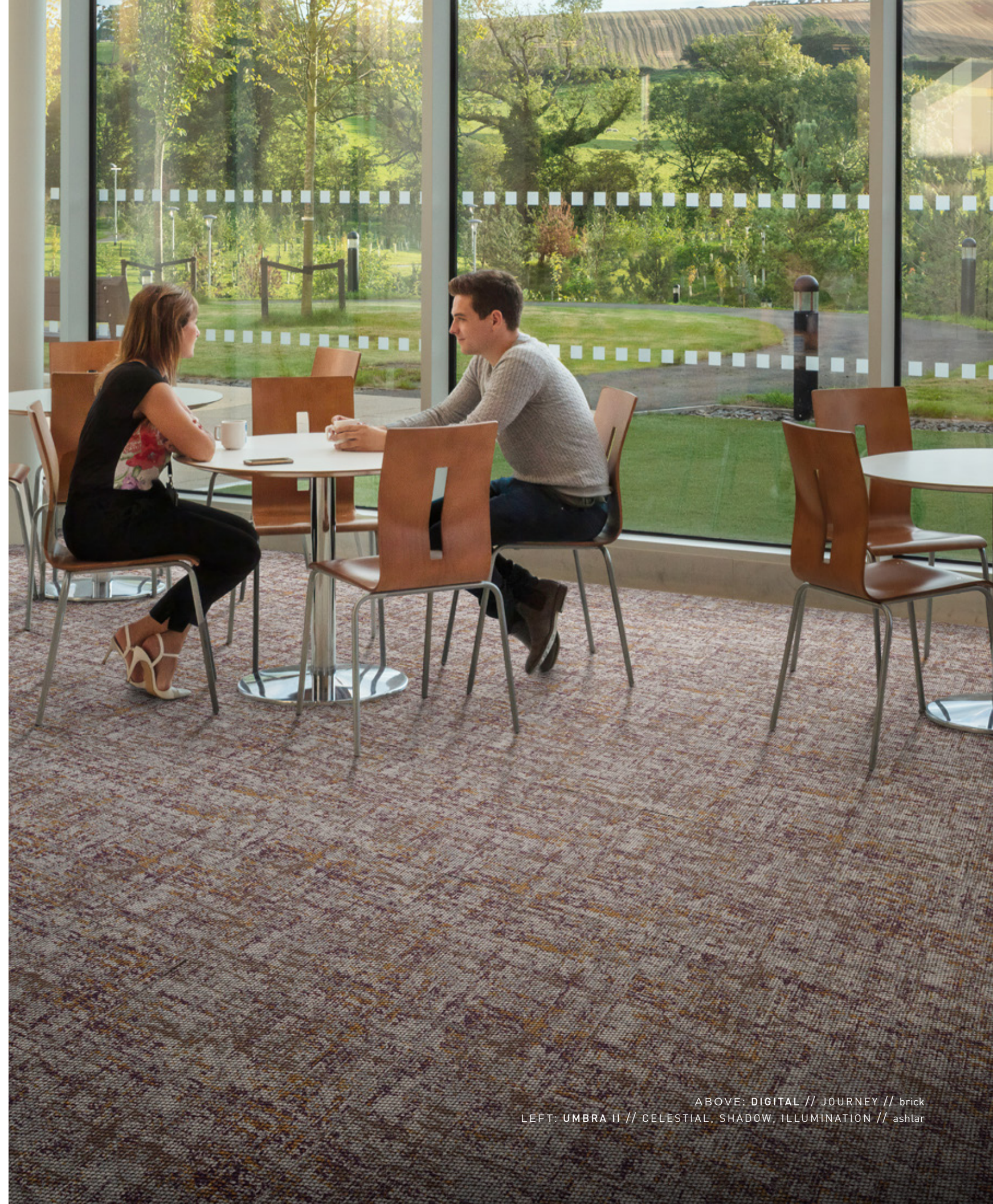
ABOVE: DIGITAL // JOURNEY // brick LEFT: UMBRA II // CELESTIAL, SHADOW, ILLUMINATION // ashlar