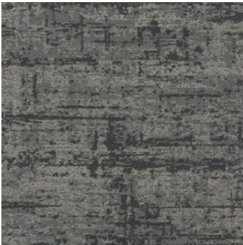
color 3109 sync