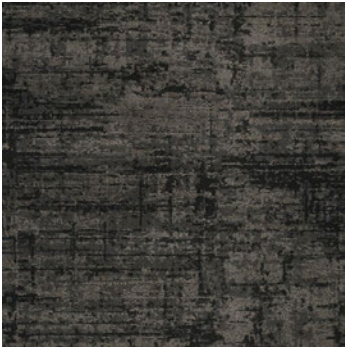
color 2258 diffuse