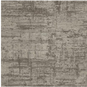
color 2255 warm toned