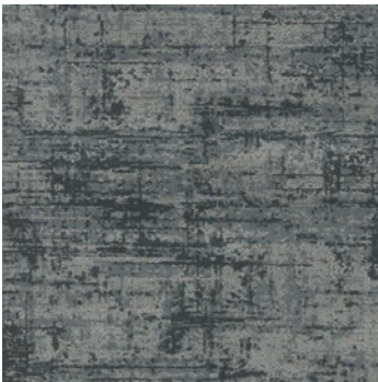
color 2265 grayscale