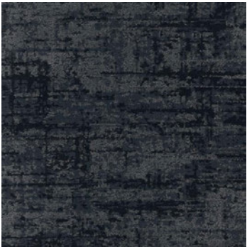
color 3110 burst