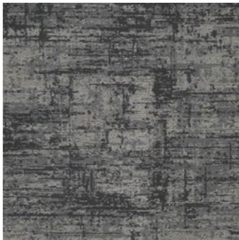
color 2262 neutral density