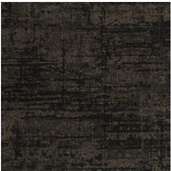
color 3106 noise