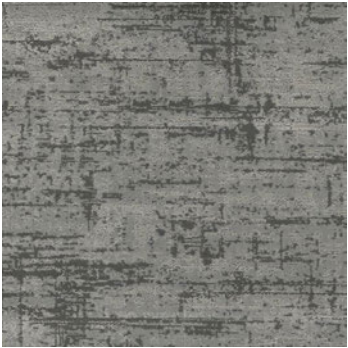
color 2261 haze grey