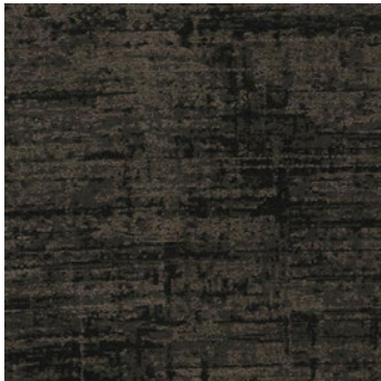
color 3108 shutter