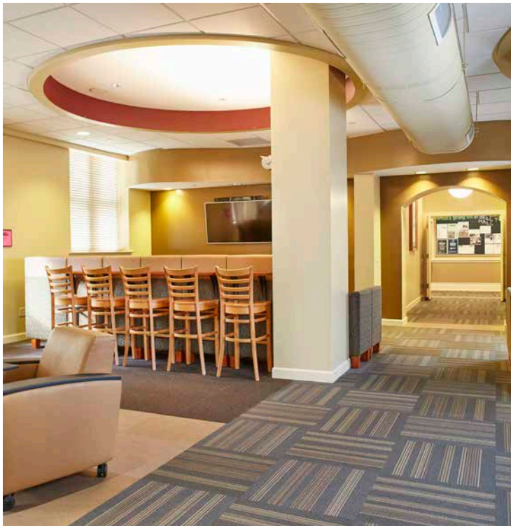
Student Lounge, Velocity and Accelerate