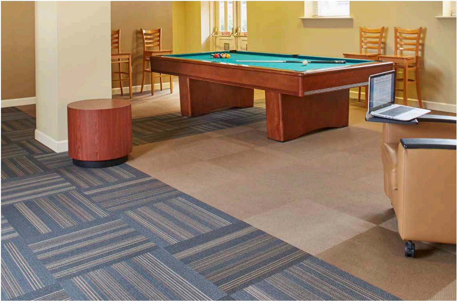
Student Lounge, Velocity and Accelerate