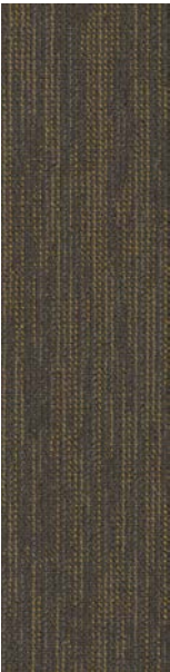
style 7081 2715 weave