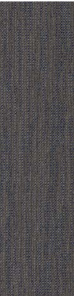
style 7081 2714 nubby