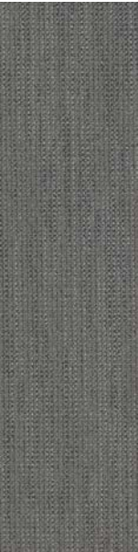
style 7081 2709 character