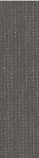
style 7081 2710 tweed