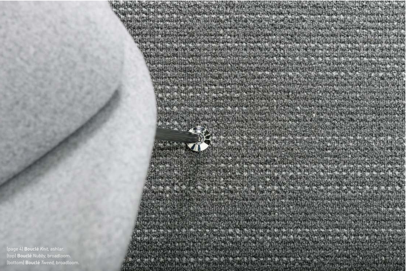
(page 4) Bouclé Knit , ashlar. (top) Bouclé Nubby , broadloom. (bottom) Bouclé Tweed , broadloom.