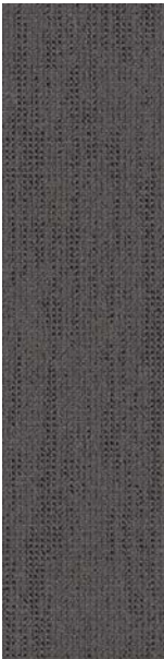
style 7081 2711 knit