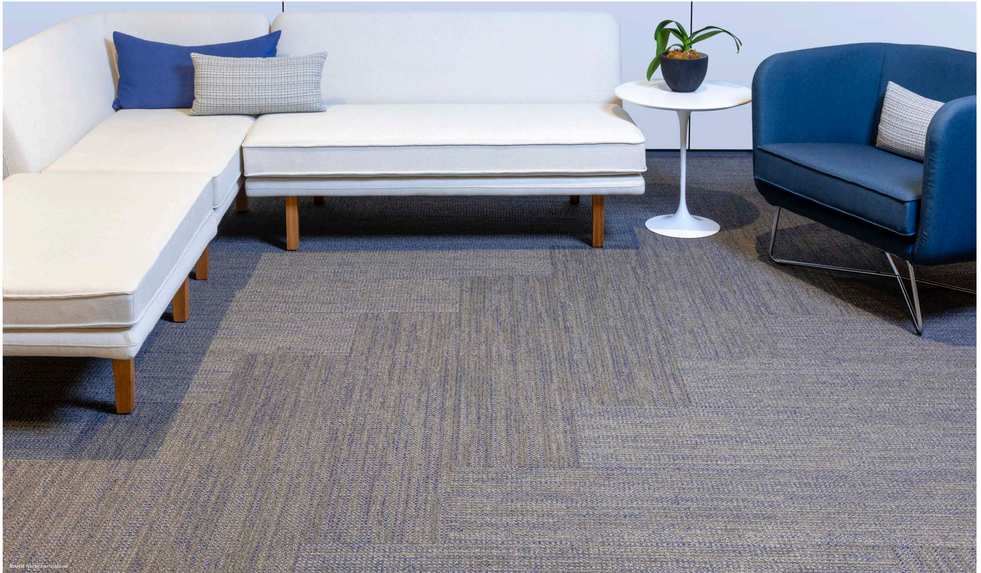
Bouclé Nobby, herringbone.