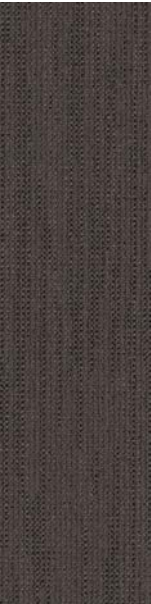
style 7081 2707 fiber