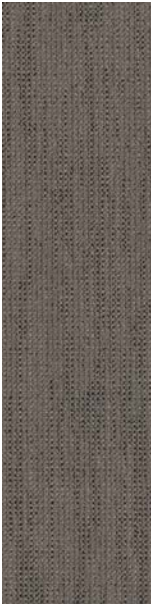
style 7081 2703 texture