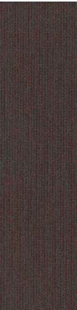
style 7081 2716 structure

(left) from top: Bouclé Knit, Weave, Tweed, Knot and Nubby.