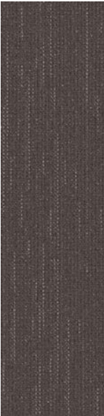
style 7081 2706 strand