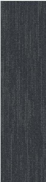
style 7081 2712 knot