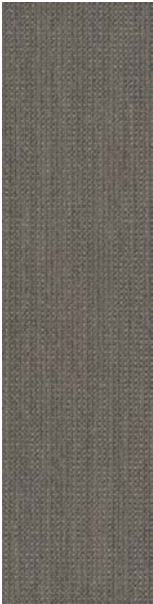
style 7081 2704 variegated