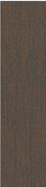
style 7081 2713 loop