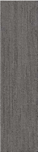
style 7081 2708 warp