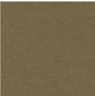
style 7031 1961 undertone