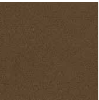
style 7031 1966 dye