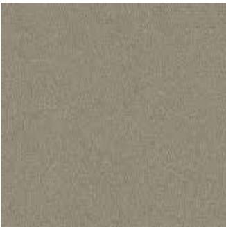
style 7031 1952 wash