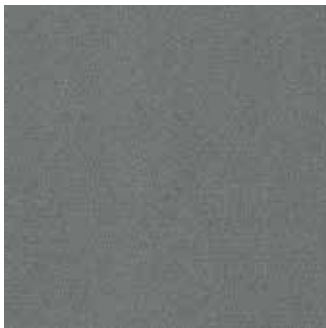
style 7031 1959 tint