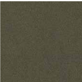
style 7031 1960 value