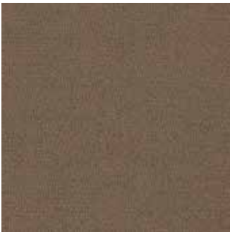
style 7031 1969 primary