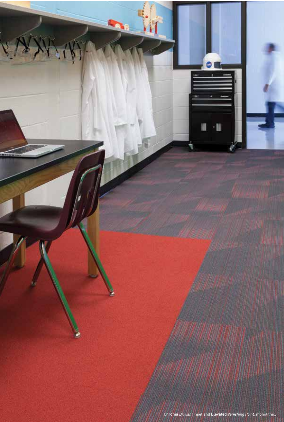
Chroma Brilliant inset and Elevated Vanishing Point, monolithic.

To be used for borders, accents and insets only.