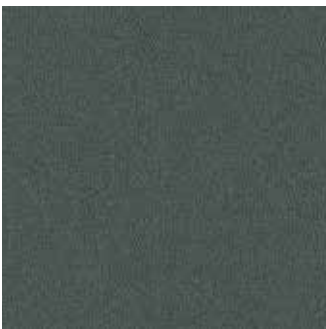
style 7031 1980 dimension