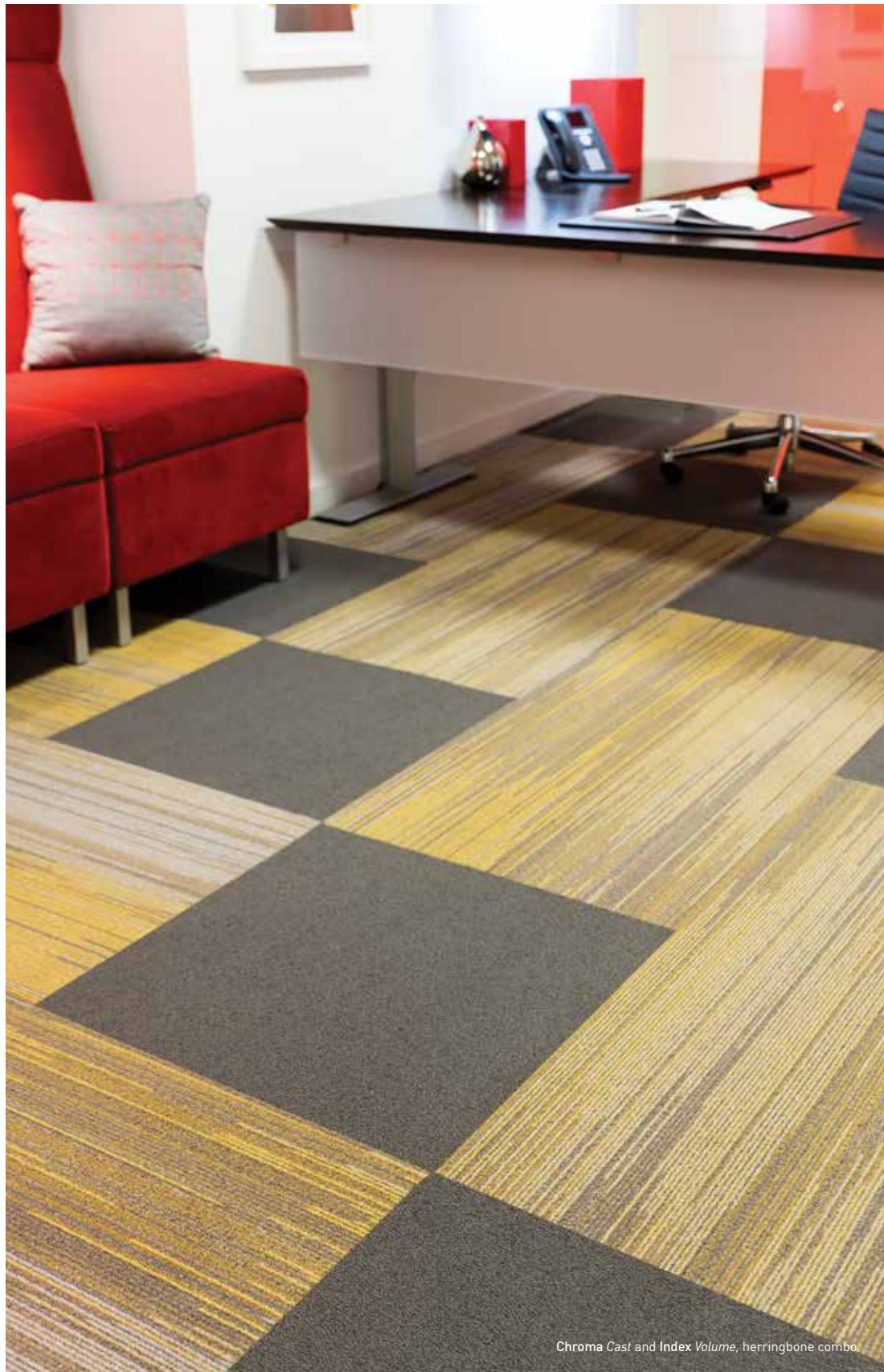
Chroma Cast and Index Volume, herringbone combo.

To be used for borders, accents and insets only.