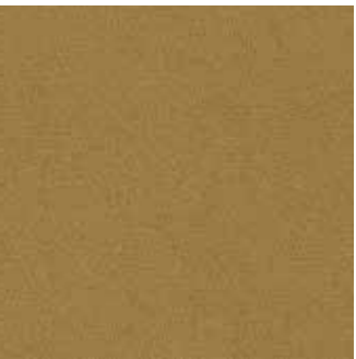
style 7031 1962 pigment