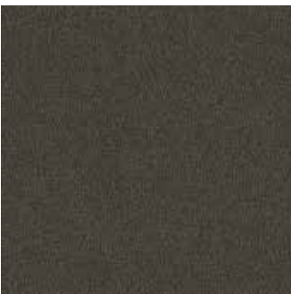
style 7031 1964 shade