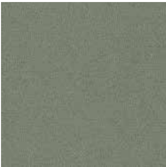
style 7031 1968 radiant