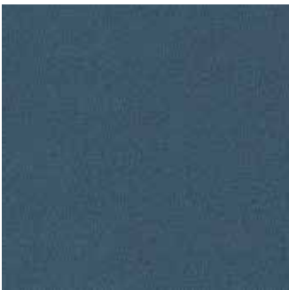
style 7031 1976 saturation