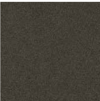
style 7031 1965 rich