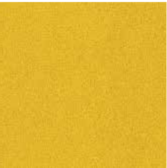
style 7031 1970 bright