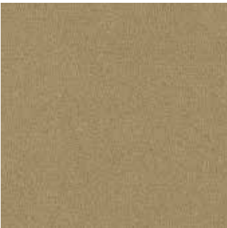
style 7031 1953 tone