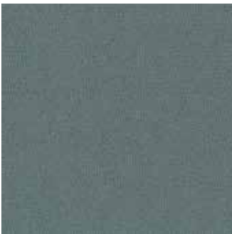
style 7031 1972 clear