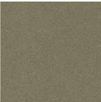
style 7031 1956 warm