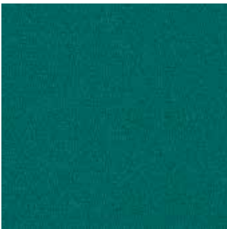
style 7031 1973 vivid