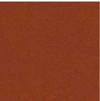
style 7031 1974 pure