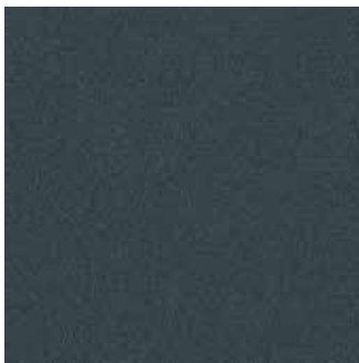
style 7031 1963 hue