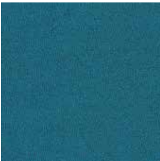
style 7031 1977 electric