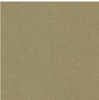
style 7031 1957 luminance