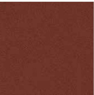
style 7031 1982 brilliant