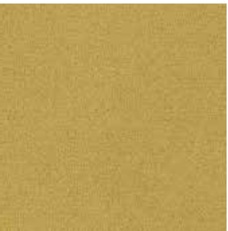
style 7031 1958 glow