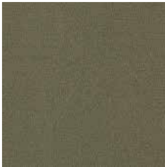
style 7031 1967 chameleon