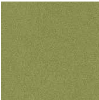
style 7031 1971 crisp