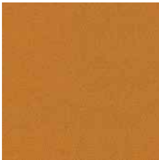
style 7031 1975 intense