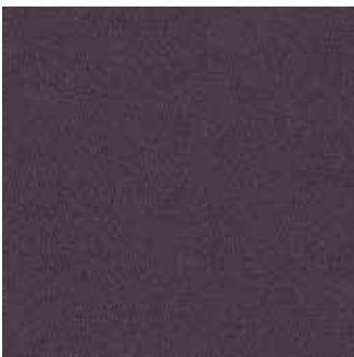
style 7031 1981 spectrum