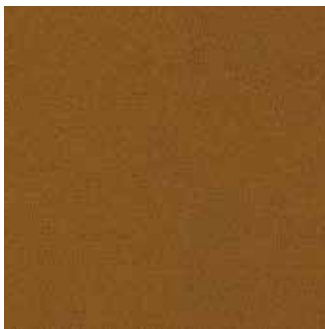
style 7031 1979 tinge