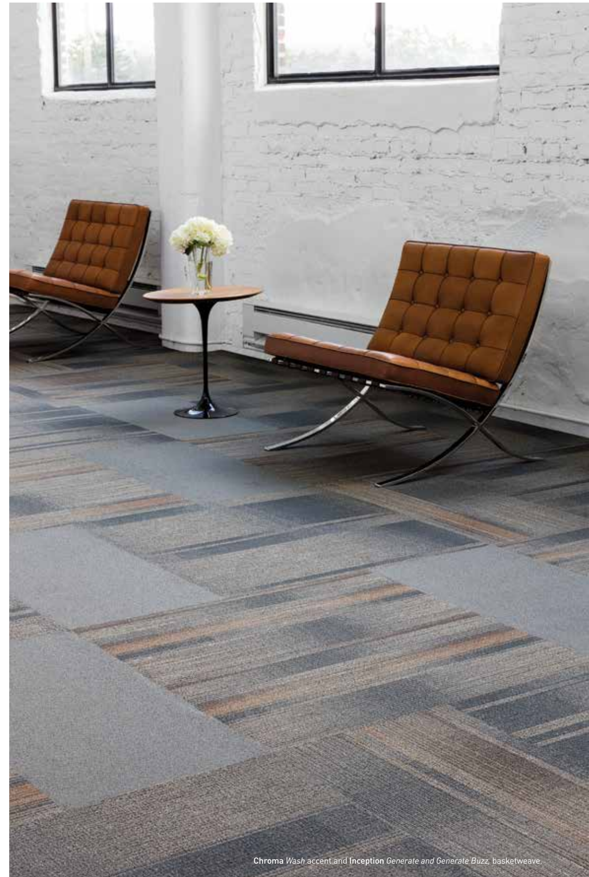
Chroma Wash accent and Inception Generate and Generate Buzz, basketweave.

To be used for borders, accents and insets only.