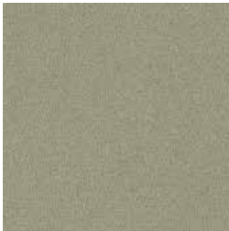
style 7031 1951 cool

Available in 24" x 24" tiles, 18" x 36" planks and 12" x 48" demi-planks. See more at jjflooringgroup.com