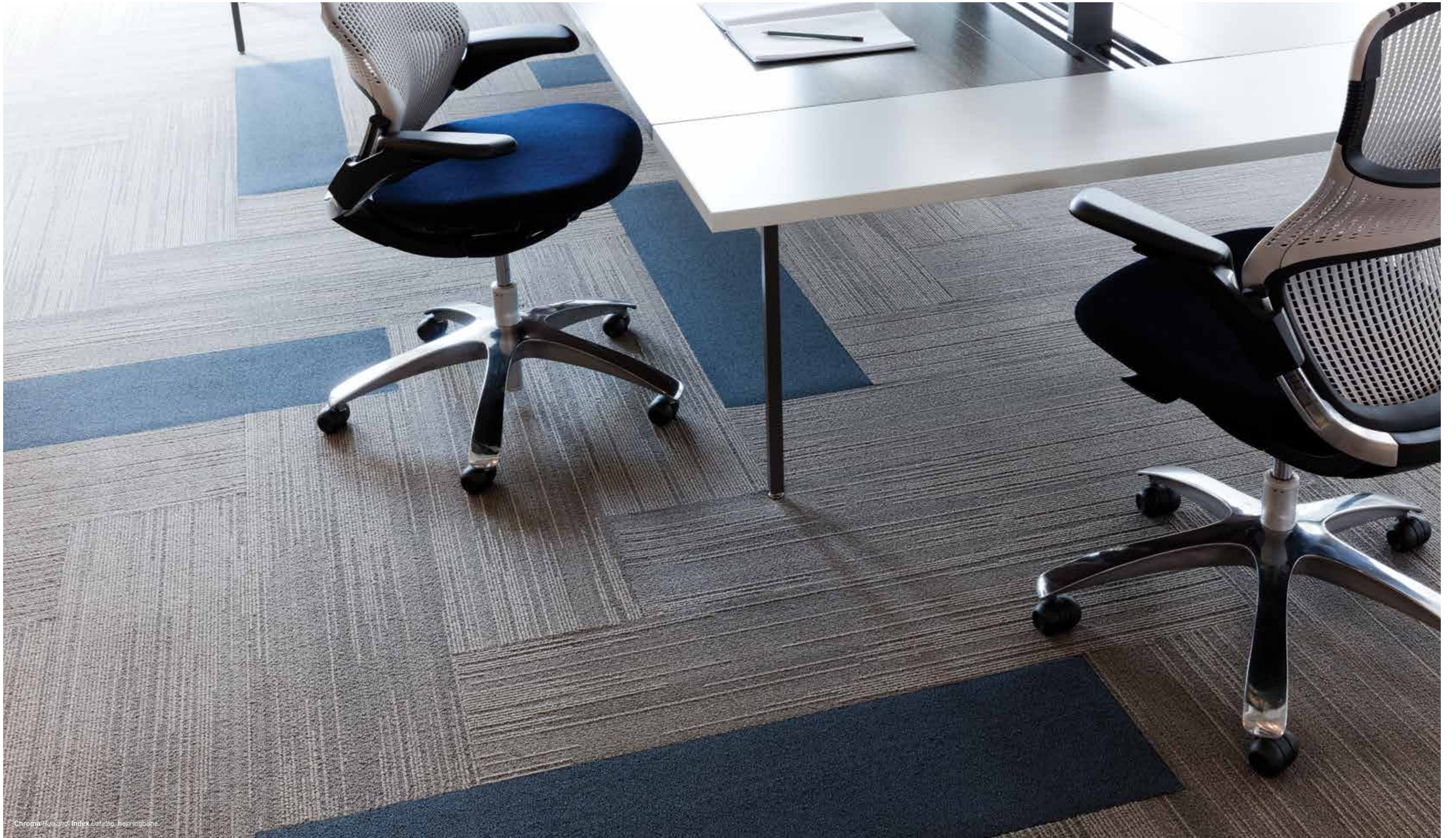
Chroma Hue and Index Catalog, herringbone

To be used for borders, accents and insets only.