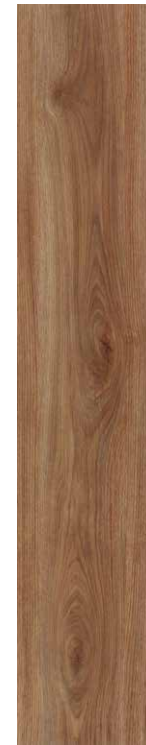
COLOR 1003 heirloom