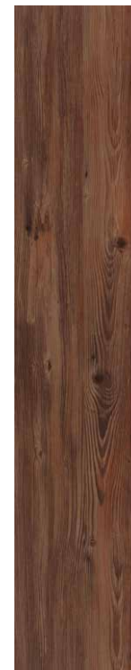
COLOR 1007 curio