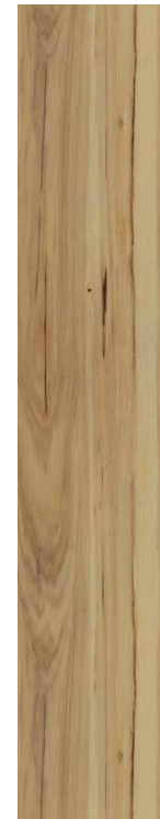
COLOR 1002 established