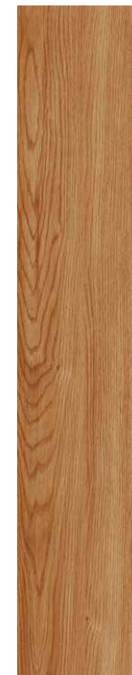
COLOR 1006 legacy