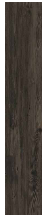
COLOR 1009 heritage