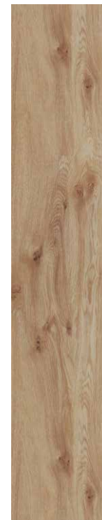
COLOR 1005 venerable