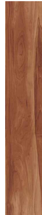
COLOR 1004 exemplar