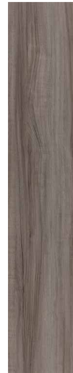
COLOR 1000 notable