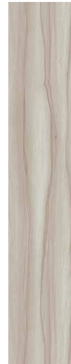
COLOR 1001 archetype