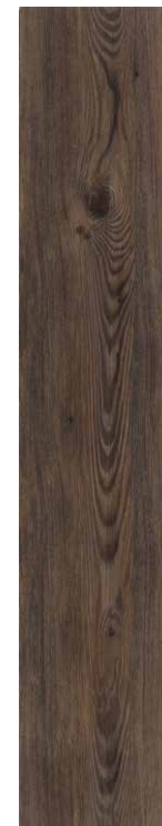
COLOR 1008 paradigm