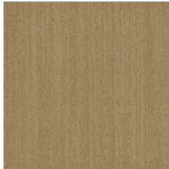
COLOR 3379 goldenrod