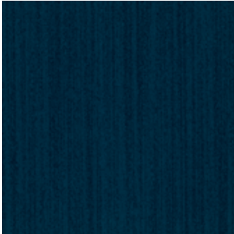
COLOR 3372 navy