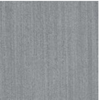
COLOR 3221 ash