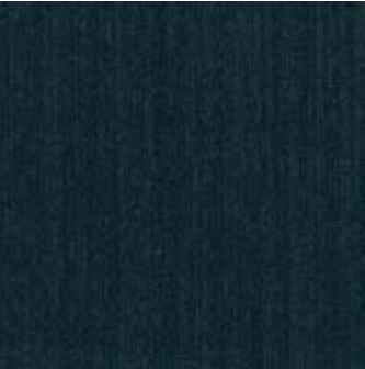
COLOR 3223 black