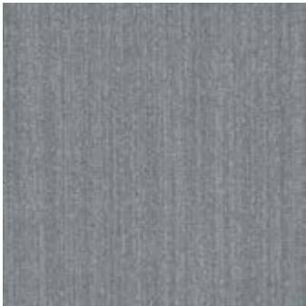
COLOR 3224 flint