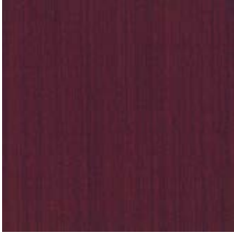
COLOR 3369 wine