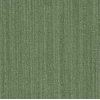
COLOR 3386 moss