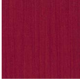
COLOR 3368 cherry