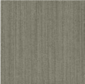
COLOR 3373 fern