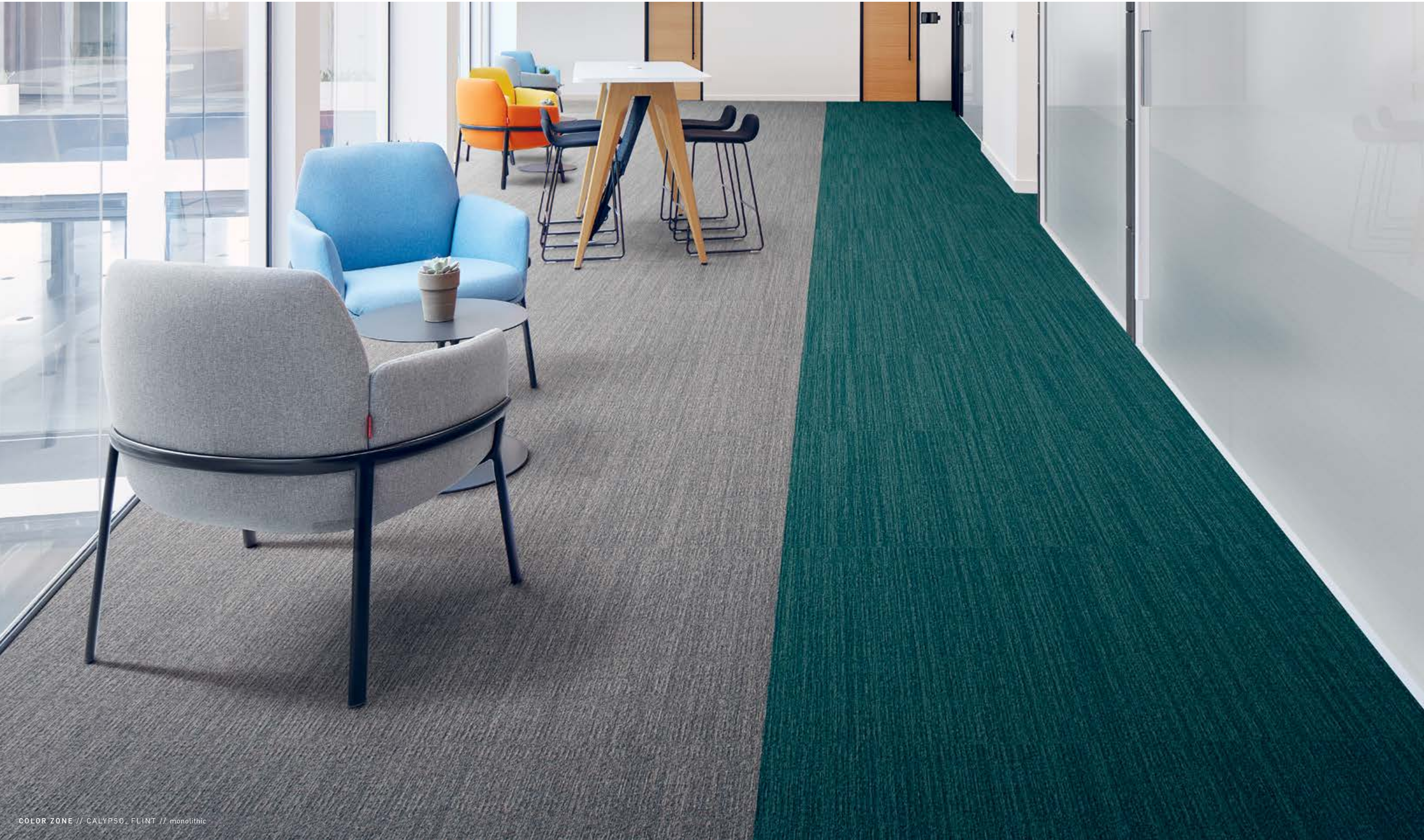
COLOR ZONE // CALYPSO, FLINT // monolithic