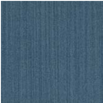
COLOR 3376 cornflower