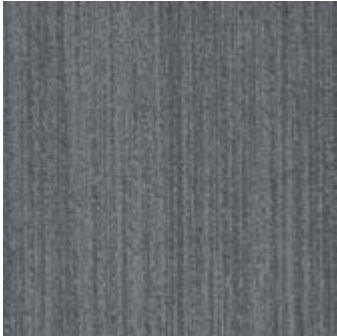
COLOR 3225 pepper