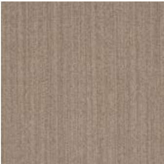
COLOR 3377 sand