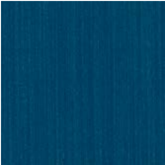
COLOR 3370 cobalt