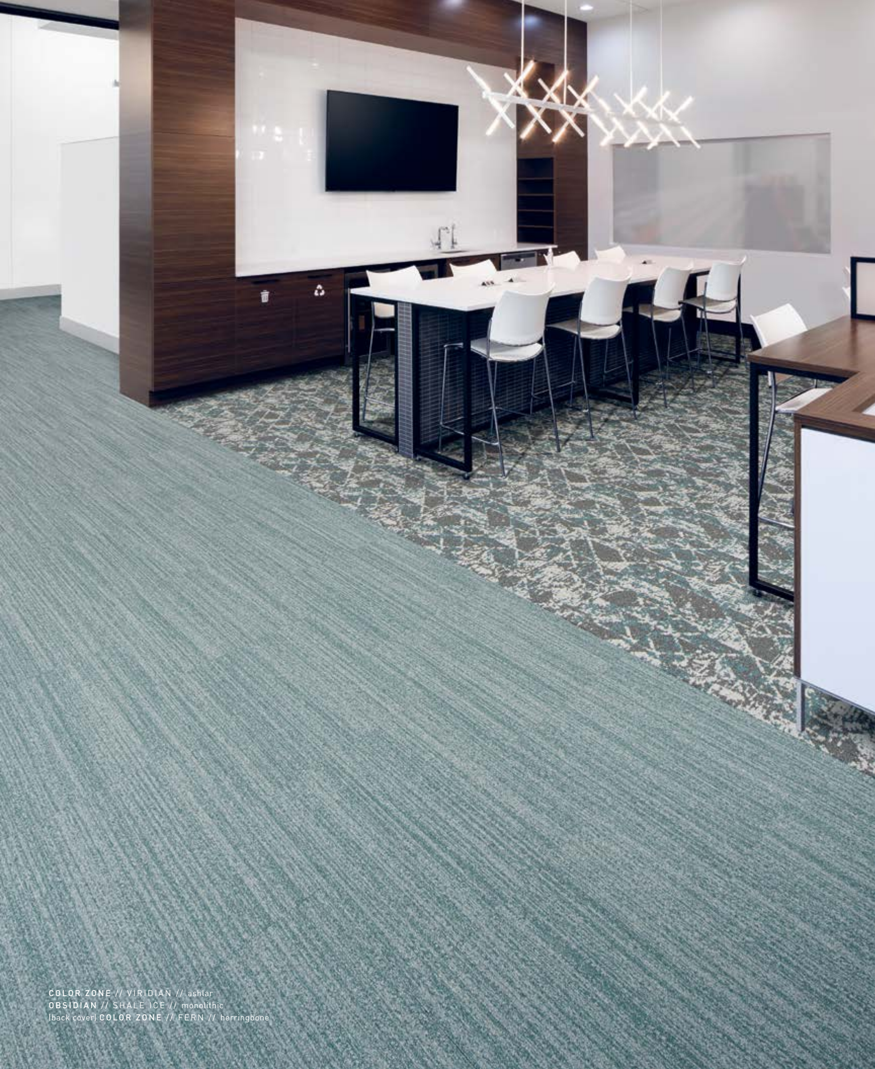
COLOR ZONE // VIRIDIAN // ashlar OBSIDIAN // SHALE ICE // monolithic [back cover] COLOR ZONE // FERN // herringbone