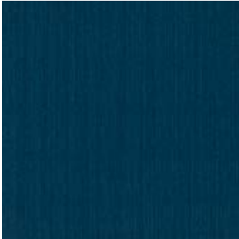
COLOR 3383 jet