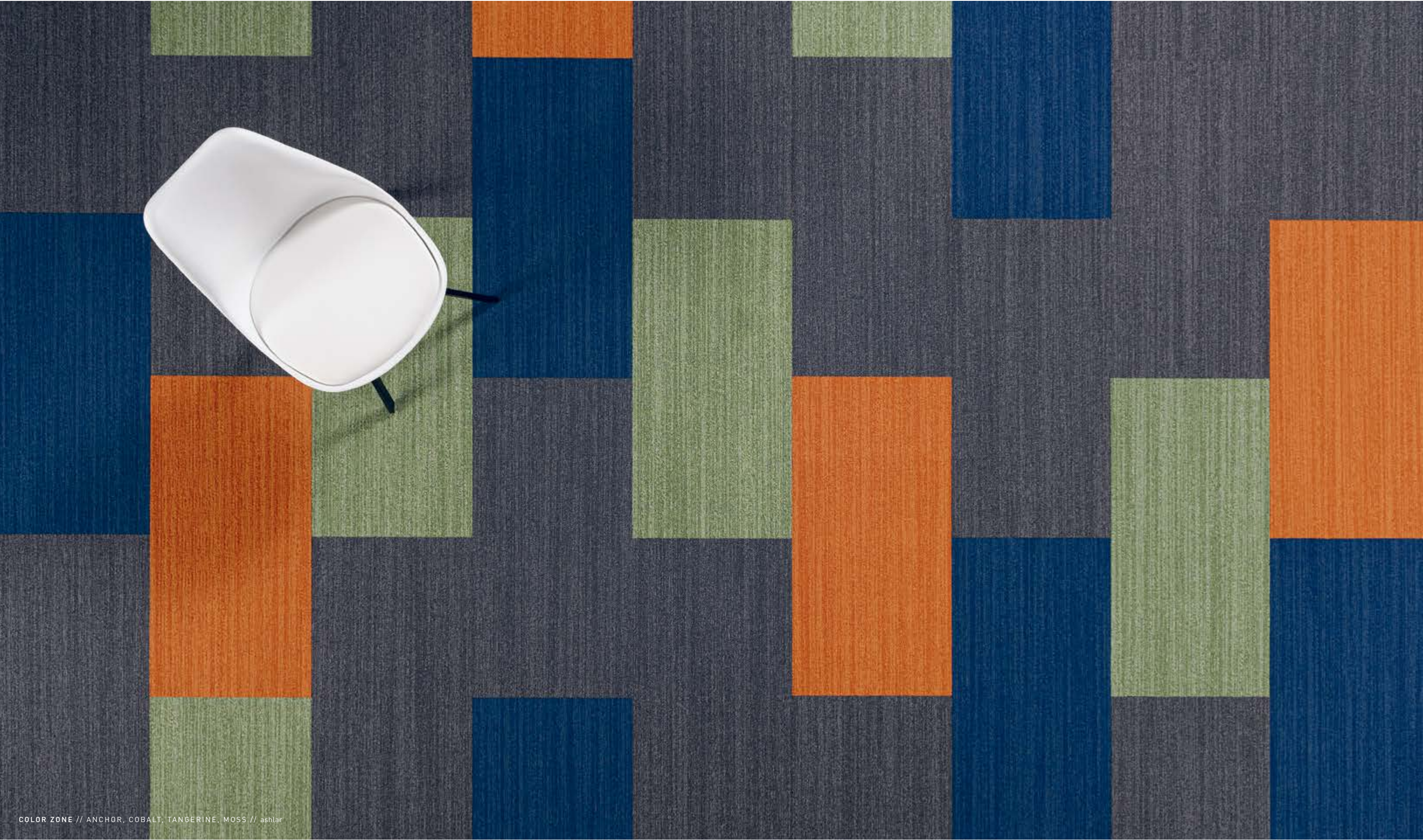
COLOR ZONE // ANCHOR, COBALT, TANGERINE, MOSS // ashlar