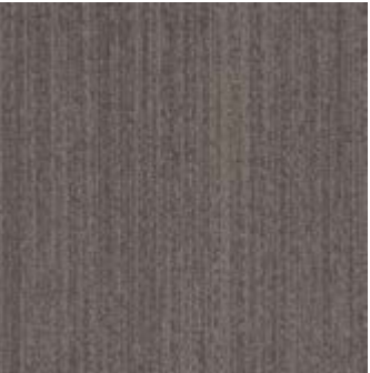
COLOR 3222 carbon