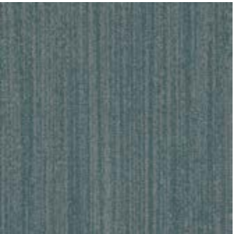
COLOR 3385 viridian