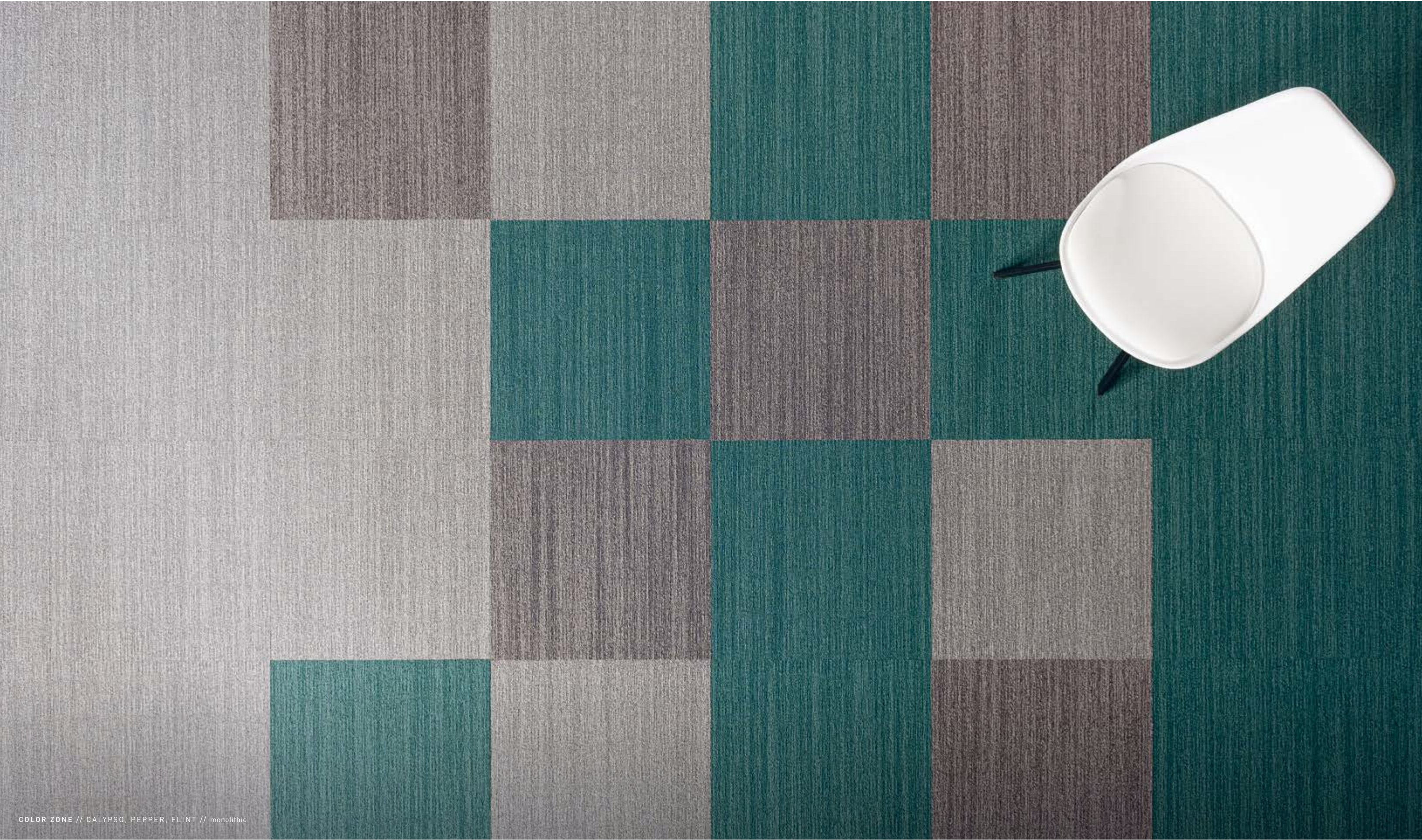
COLOR ZONE // CALYPSO, PEPPER, FLINT // monolithic