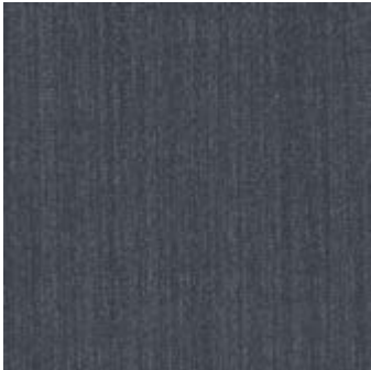
COLOR 3226 anchor