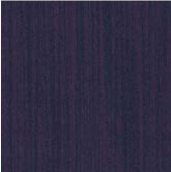
COLOR 3371 grape