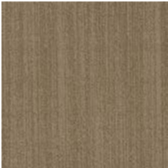
COLOR 3378 brass