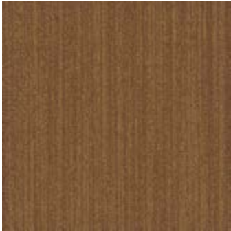
COLOR 3381 copper