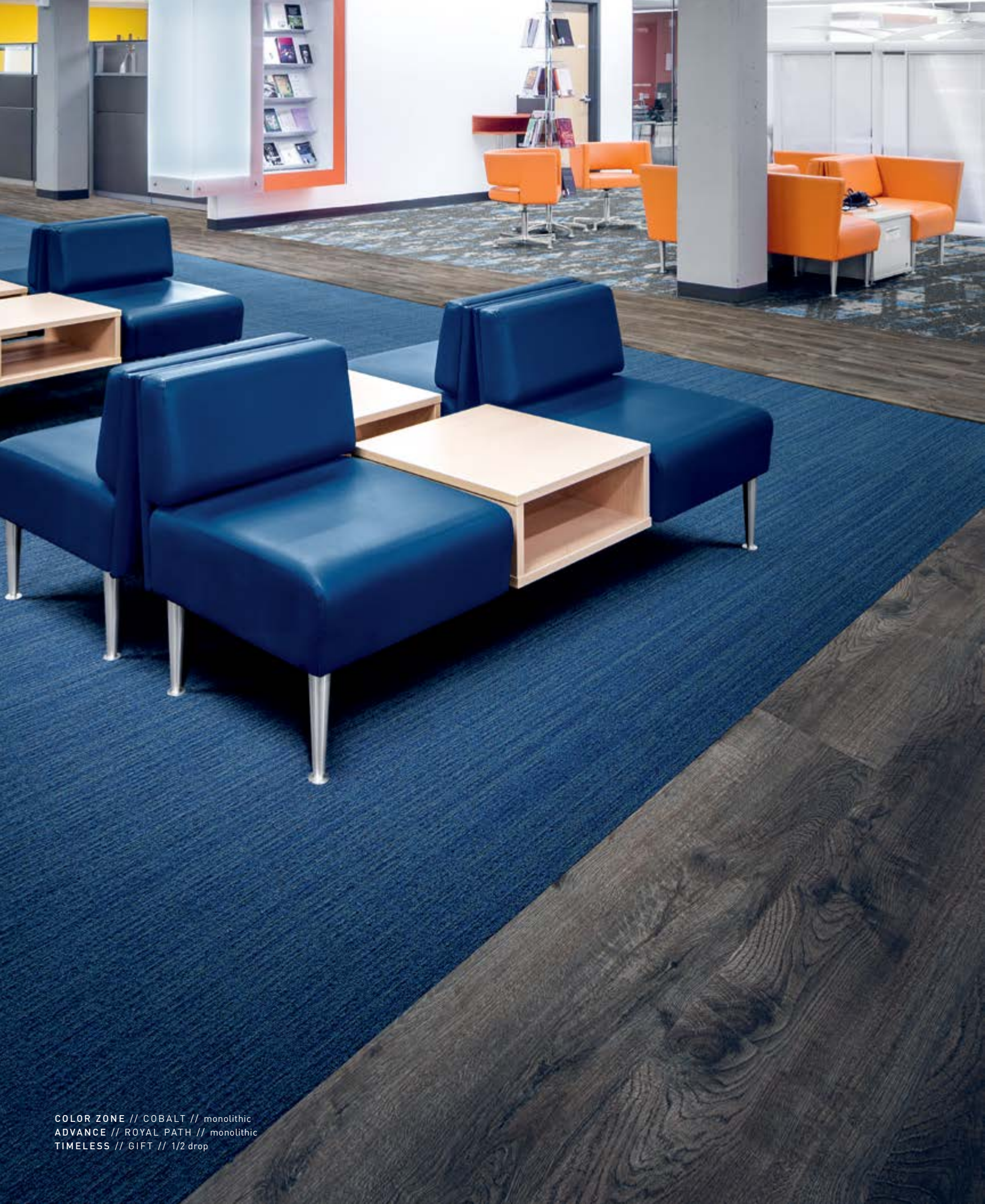
COLOR ZONE // COBALT // monolithic ADVANCE // ROYAL PATH // monolithic TIMELESS // GIFT // 1/2 drop