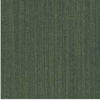
COLOR 3375 olive