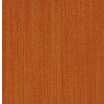
COLOR 3382 tangerine