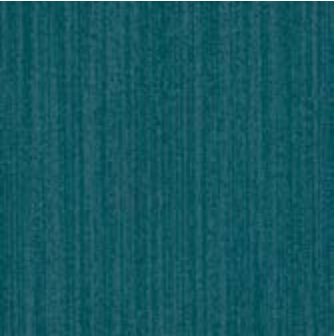
COLOR 3387 calypso