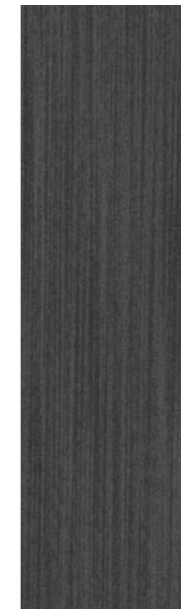
COLOR 3063 synthesize