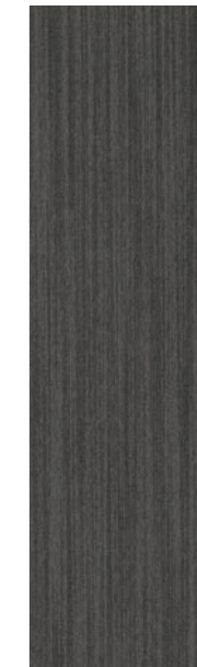
COLOR 3068 combine