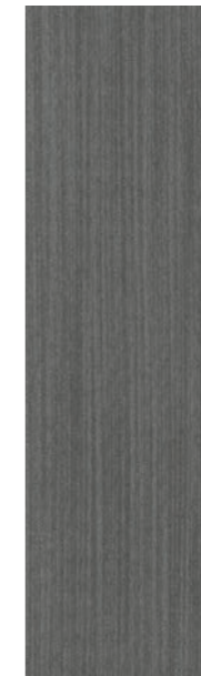
COLOR 3064 consolidate