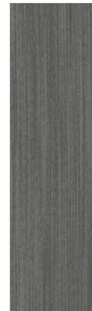
COLOR 3070 compose