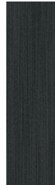
COLOR 3072 unify