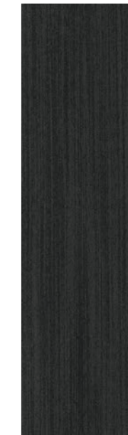
COLOR 3069 incorporate