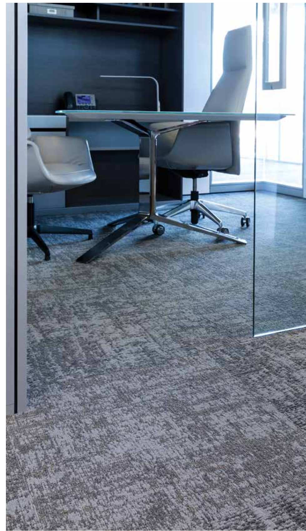
[above] Craftwork Glassblower & Potter , monolithic. [center] Craftwork Potter , quarter turn. [right] Craftwork Quilter , quarter turn. [pages 8 & 9] Craftwork Potter , broadloom.