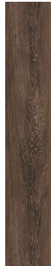
COLOR 1012 anchor