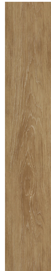
COLOR 1010 pier