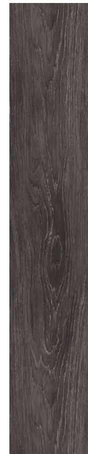
COLOR 1014 partition