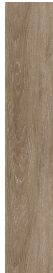
COLOR 1015 beam