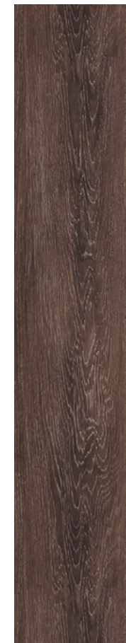
COLOR 1013 brace