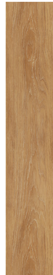
COLOR 1011 header