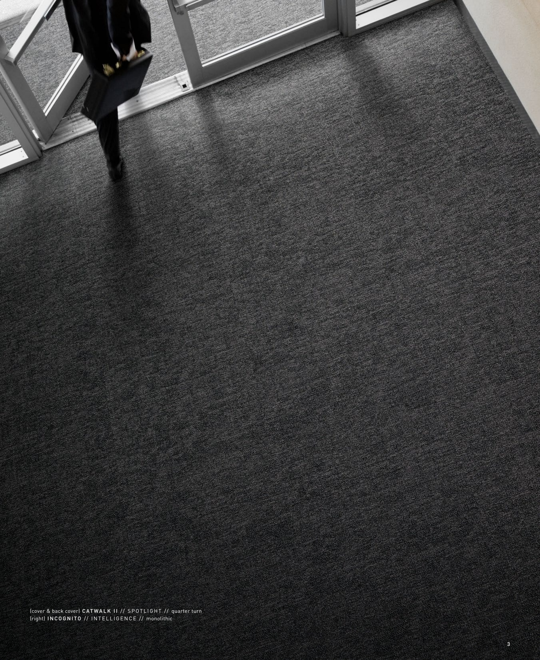
(cover & back cover) CATWALK II // SPOTLIGHT // quarter turn (right) INCOGNITO // INTELLIGENCE // monolithic

Since 85% of carpet soil and other contaminants come into the building on shoe soles, we also recommend using entryway systems at all entrances to trap and hold dirt and other pathogens before they are tracked into interior floor surfaces. A minimum of 15-ft. of entryway system is needed.