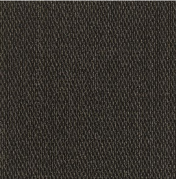
COLOR 1424 glitterati