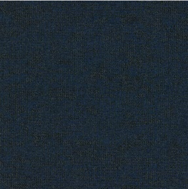
COLOR 1838 espionage