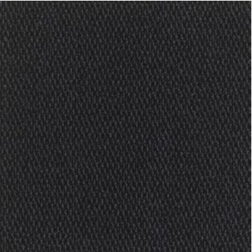
COLOR 1429 photo op