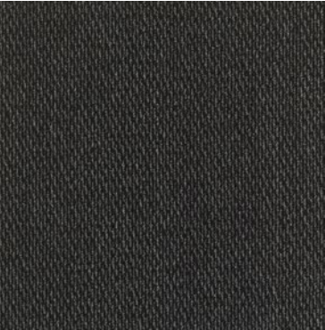
COLOR 1427 spotlight