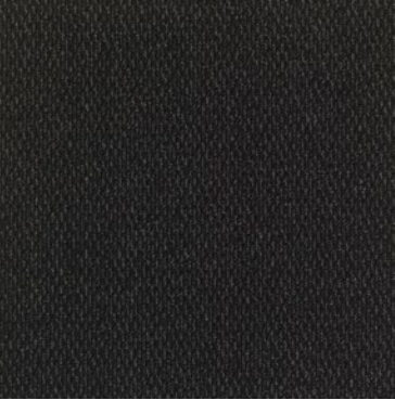
COLOR 1428 strike a pose