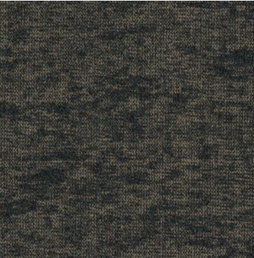
COLOR 1845 cryptic