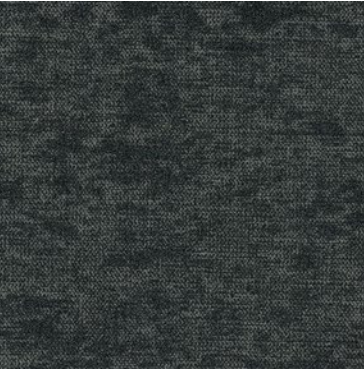
COLOR 1837 operative