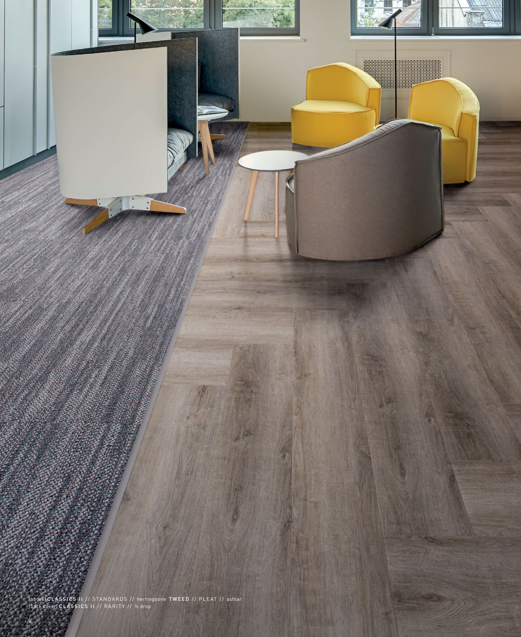
[above] CLASSICS II // STANDARDS // herringbone TWEED // PLEAT // ashlar [back cover] CLASSICS II // RARITY // ½ drop