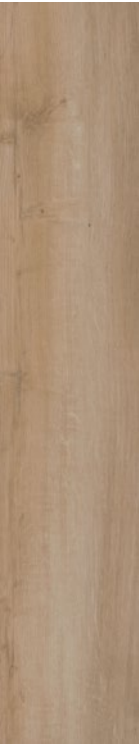
COLOR 1087 ideal