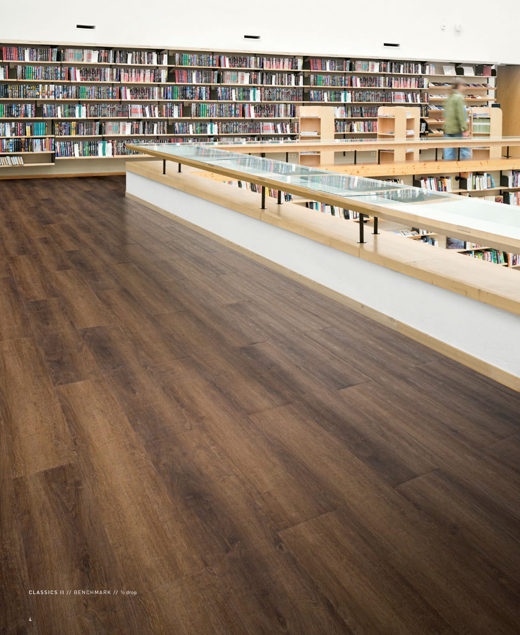
CLASSICS II // BENCHMARK // ½ drop