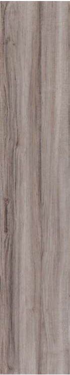
COLOR 1000 notable