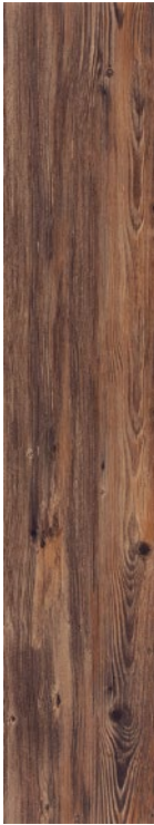
COLOR 1008 paradigm