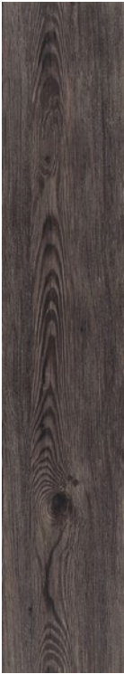
COLOR 1009 heritage