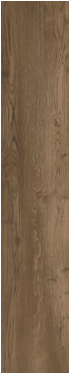
COLOR 1091 rarity