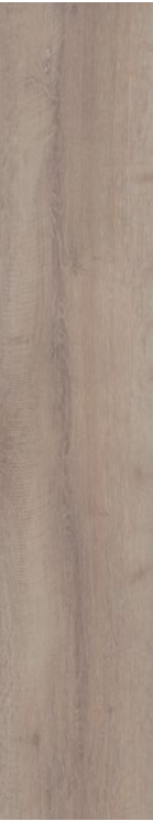
COLOR 1089 value