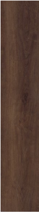
COLOR 1088 benchmark