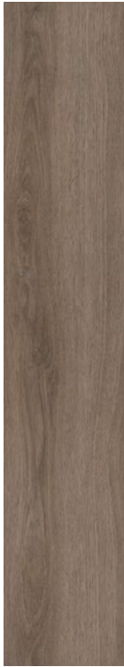
COLOR 1107 principle