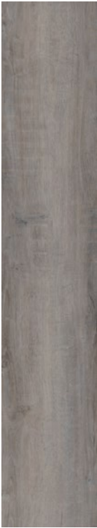
COLOR 1090 standards