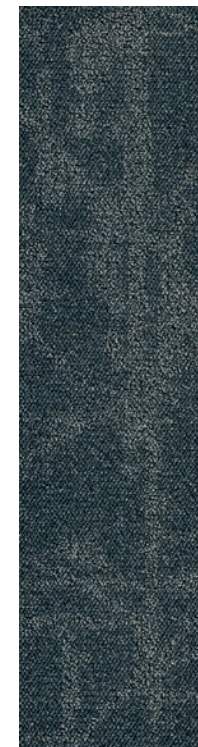
COLOR 3430 fitting

DAPPER // GARMENT // parquet [back cover] DAPPER // NOTCH // ashlar