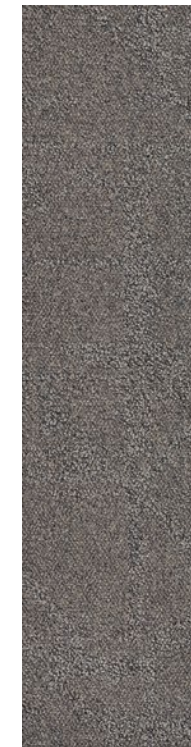
COLOR 3422 tie