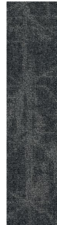
COLOR 3424 facing