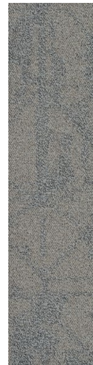
COLOR 3419 vest