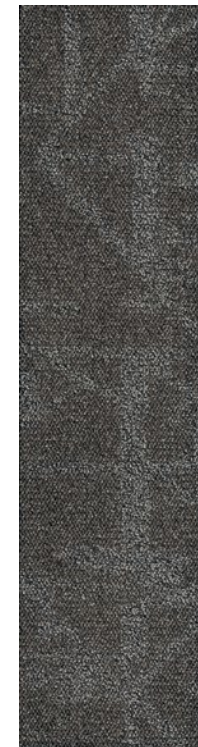
COLOR 3421 lapel