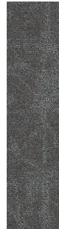
COLOR 3420 blazer