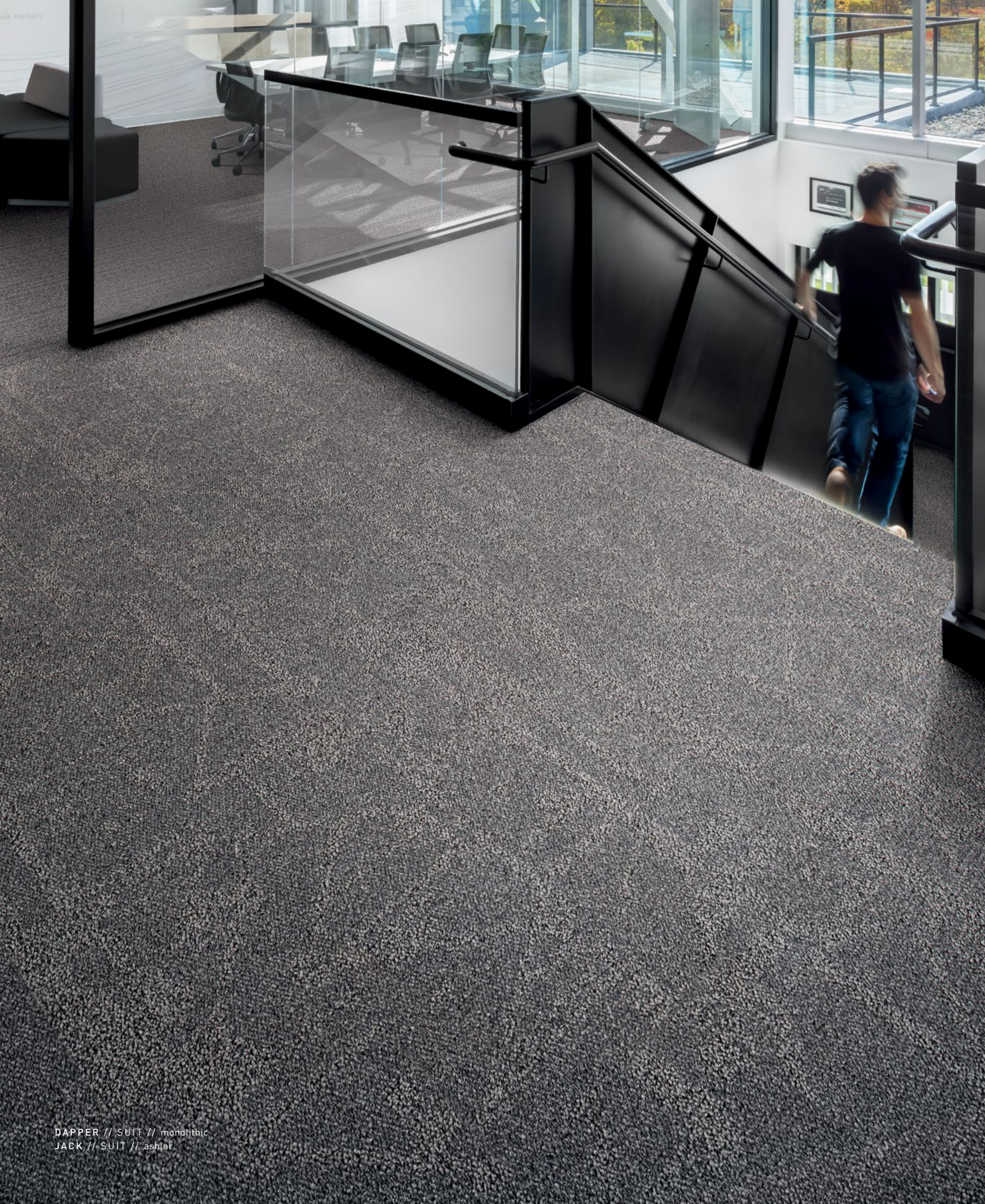
DAPPER // SUIT // monolithic JACK // SUIT // ashter