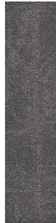
COLOR 3431 suit