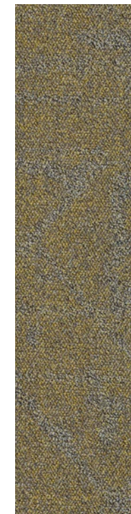
COLOR 3425 seam