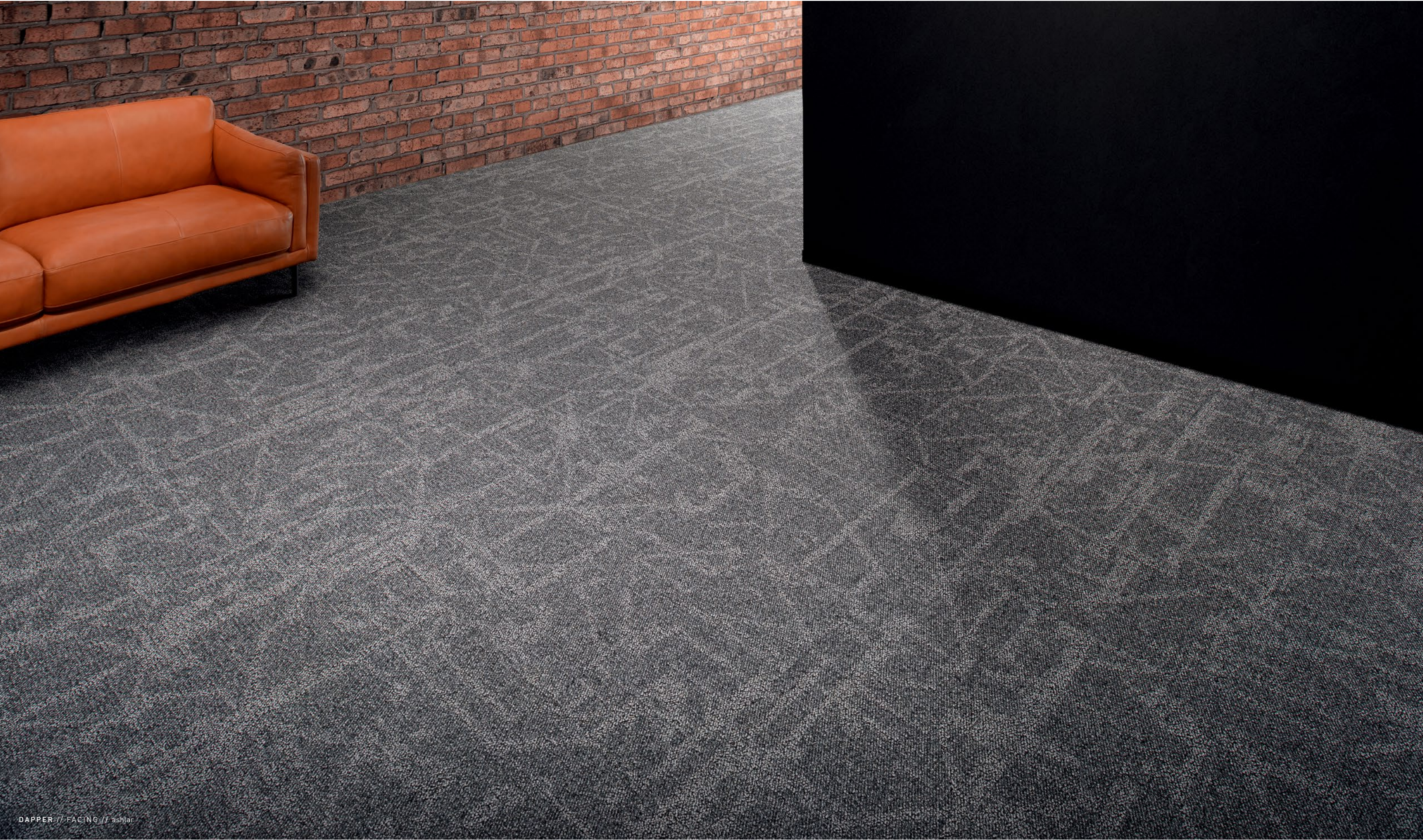
DAPPER // FACING // ashlar