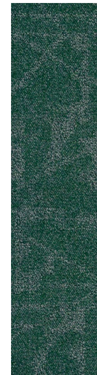
COLOR 3427 notch