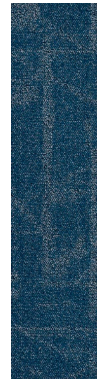
COLOR 3429 garment