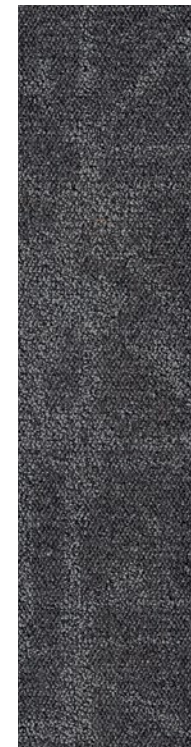
COLOR 3423 hem