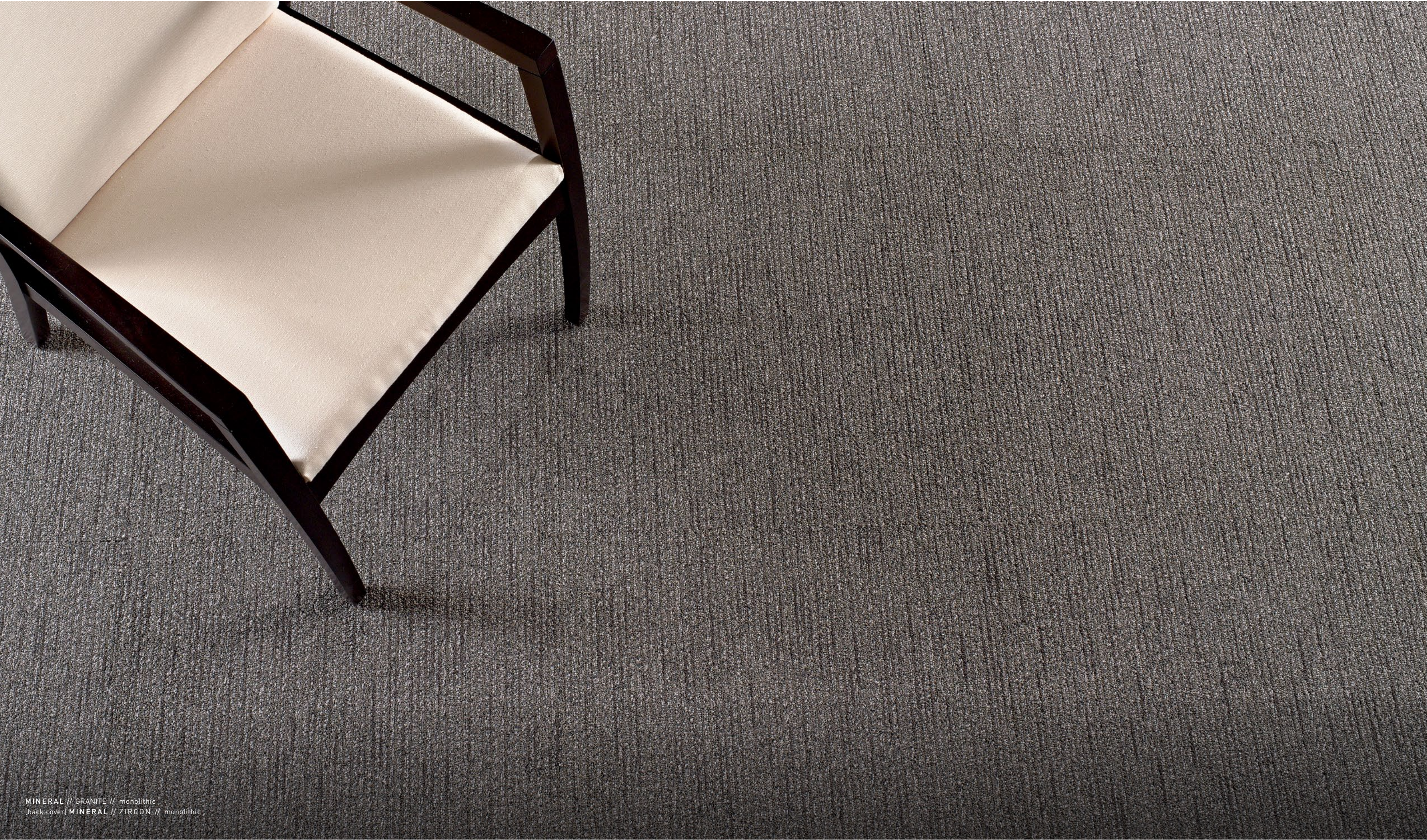
MINERAL // GRANITE // monolithic [back cover] MINERAL // ZIRCON // monolithic