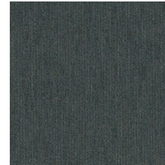
QUICK SHIP COLOR 1797 celestine