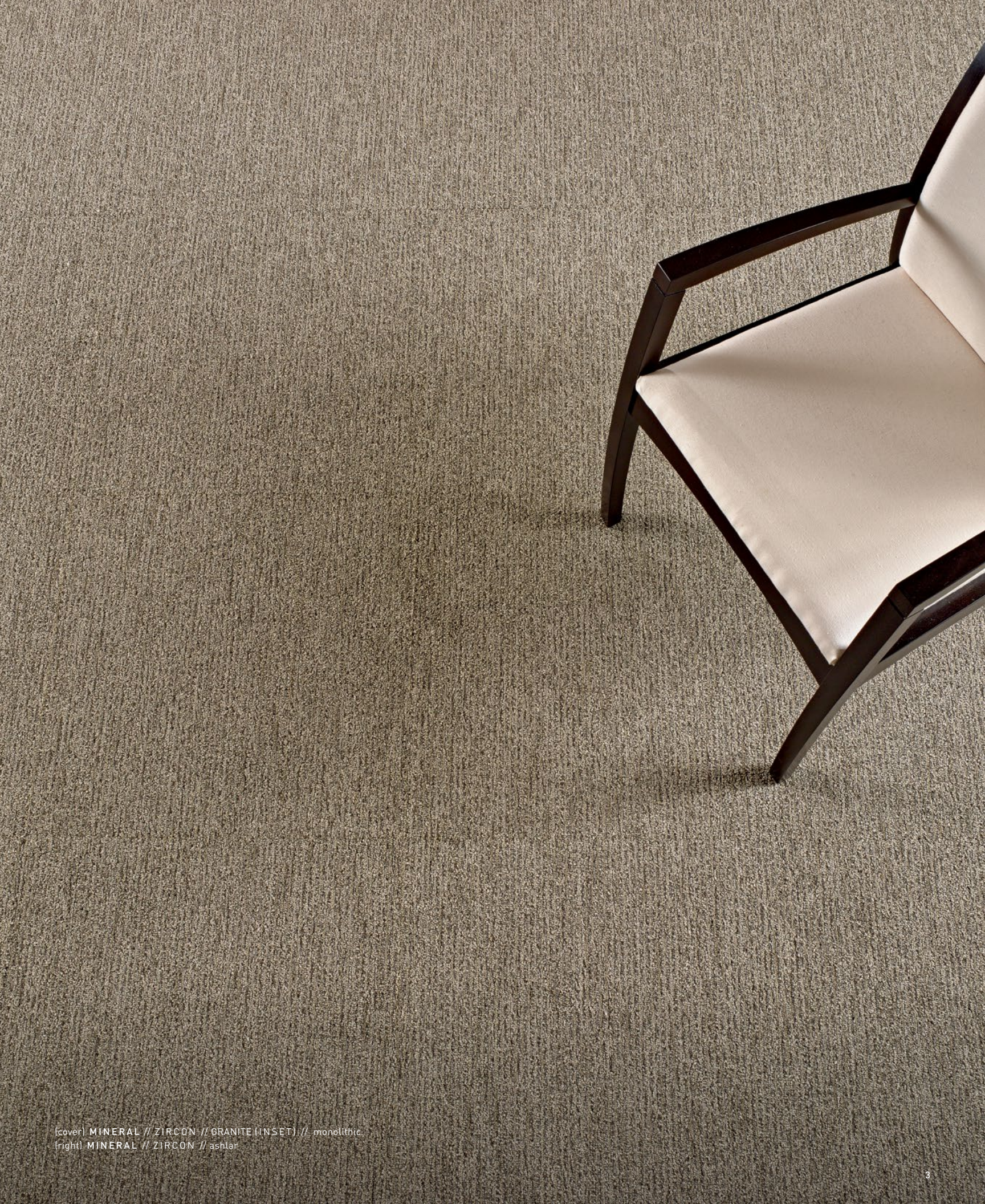
[cover] MINERAL // ZIRCON // GRANITE (INSET) // monolithic [right] MINERAL // ZIRCON // ashlar

Inspired by the colors and textures of rocky glens and fretted terrains, Mineral offers a 24" x 24" modular product that brings a classic look to multiple decors. Designed to balance performance and aesthetics, the seven near-solid colorways (four quick ship) of muted mossy greens, heathered grays and hazy chestnuts coordinate beautifully across our product portfolio.