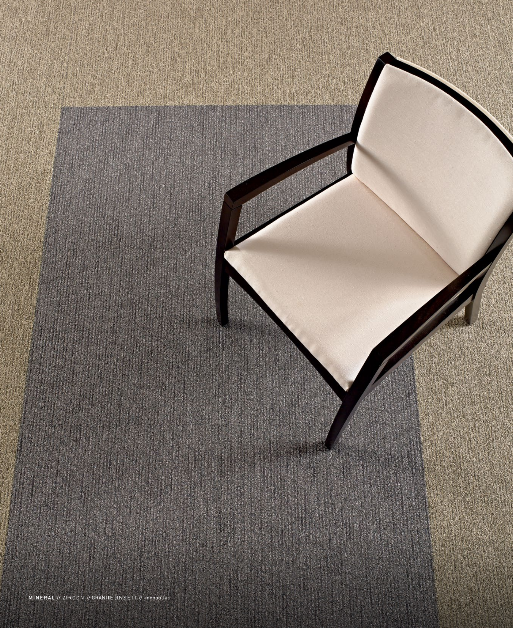
MINERAL // ZIRCON // GRANITE (INSET) // monolithic