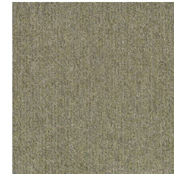
COLOR 1793 olivine