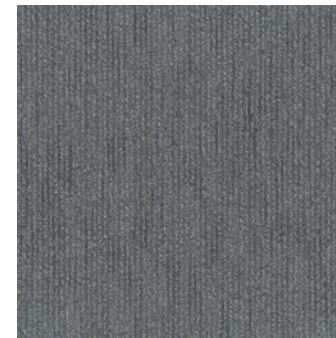
QUICK SHIP COLOR 1796 granite