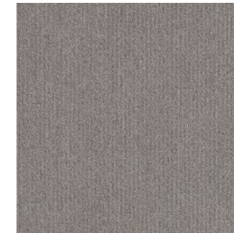
QUICK SHIP COLOR 1795 quartz