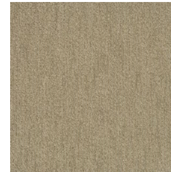
COLOR 1792 topaz