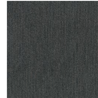
COLOR 1798 graphite