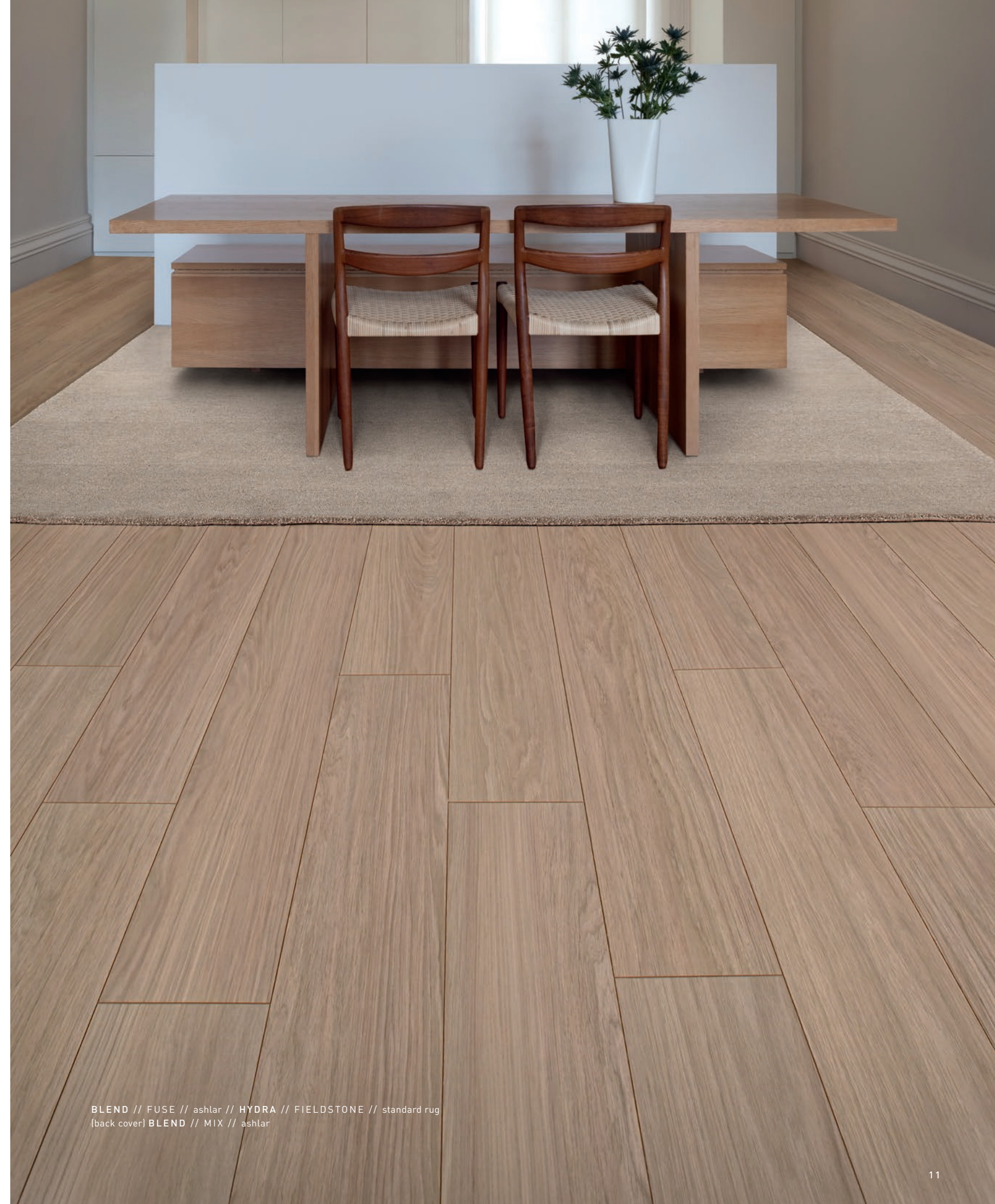
BLEND // FUSE // ashlar // HYDRA // FIELDSTONE // standard rug (back cover) BLEND // MIX // ashlar