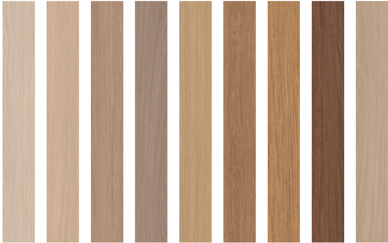
COLOR 1158 culture COLOR 1157 network COLOR 1155 merge COLOR 1159 fuse COLOR 1151 inspire COLOR 1152 transition COLOR 1156 combine COLOR 1153 community COLOR 1154 mix