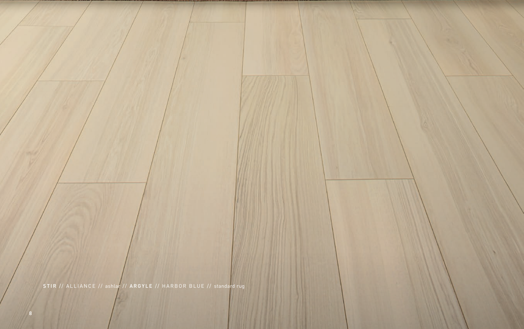
STIR // ALLIANCE // ashlar // ARGYLE // HARBOR BLUE // standard rug