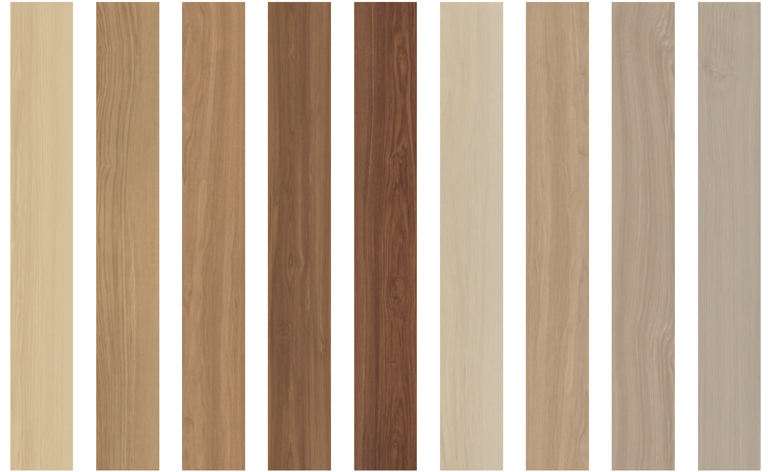
COLOR 1195 embellish COLOR 1196 fusion COLOR 1197 combination COLOR 1198 mash up COLOR 1199 collage COLOR 1200 alliance COLOR 1201 hybrid COLOR 1202 patch work COLOR 1203 unification