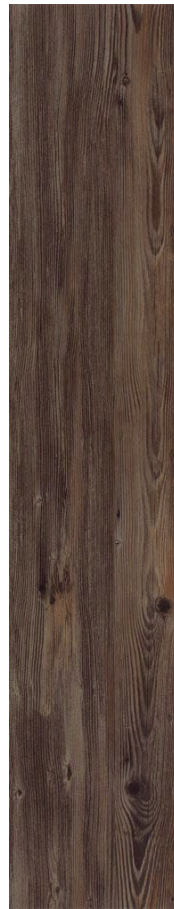
COLOR 1008 paradigm