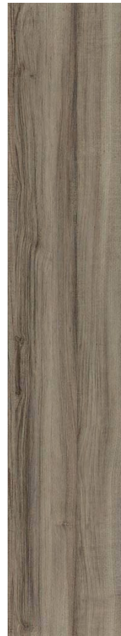
COLOR 1000 notable