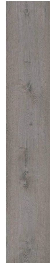
COLOR 1060 inheritance