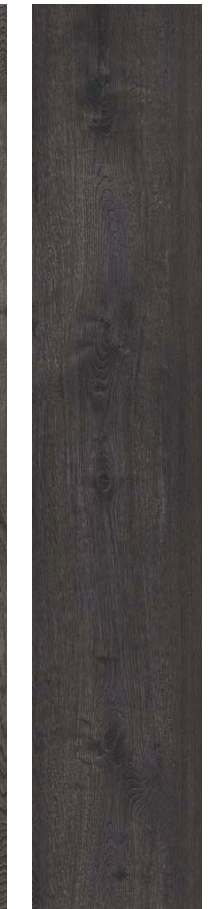
COLOR 1062 estate

TIMELESS // INHERITANCE, GIFT // herringbone (back cover) TIMELESS // ESTATE // 1/2 drop