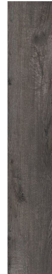
COLOR 1061 gift