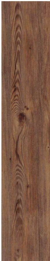
COLOR 1007 curio