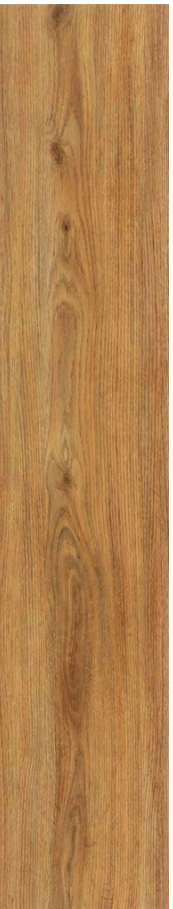
COLOR 1003 heirloom