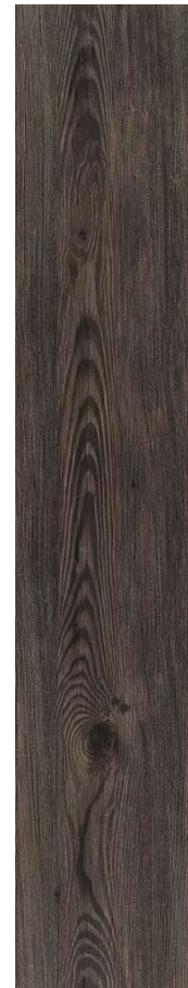
COLOR 1009 heritage