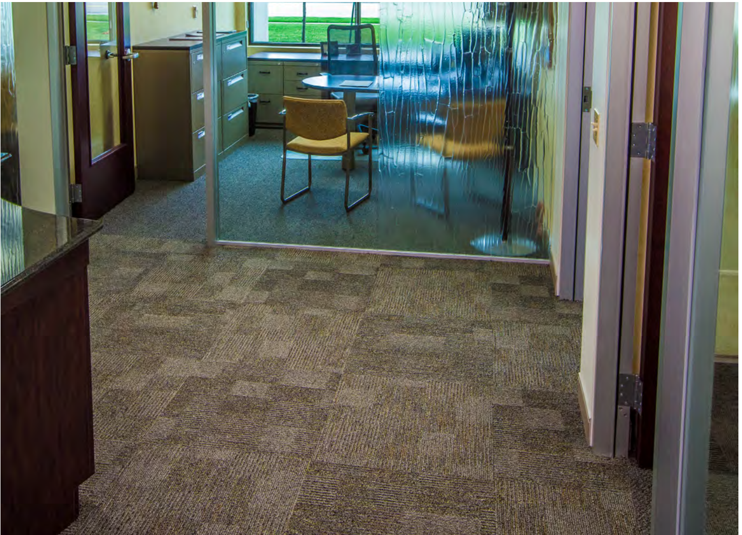
Sideshow, Big Top