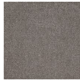
COLOR 9945 glen abbey