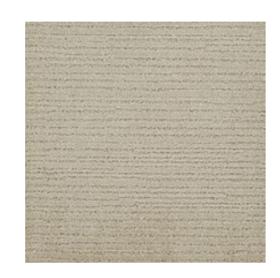
COLOR 9832 pebble beach