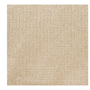
COLOR 9785 cypress point