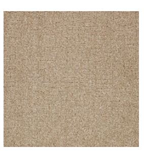
COLOR 9792 augusta