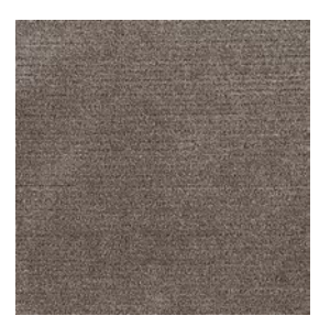
COLOR 9945 glen abbey