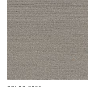
COLOR 9925 saw grass