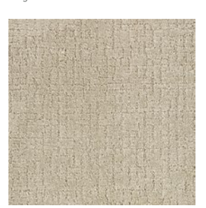
COLOR 9832 pebble beach