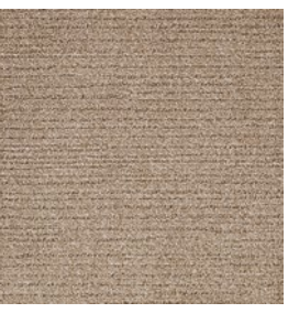
COLOR 9792 augusta