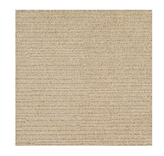
COLOR 9785 cypress point