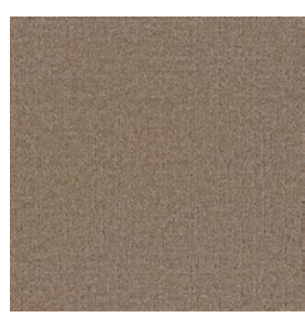
COLOR 9999 sand hills