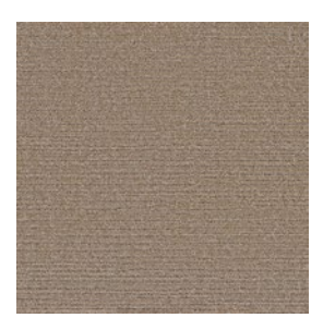
COLOR 9999 sand hills