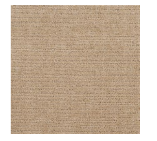
COLOR 9770 pinehurst