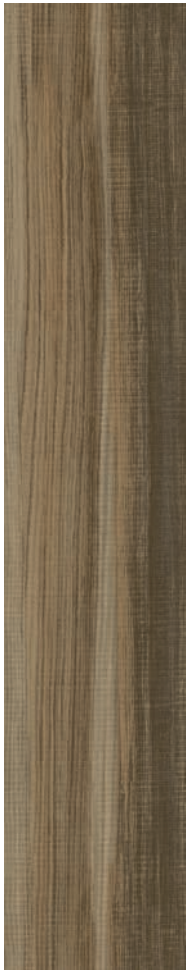
color 1054 melting