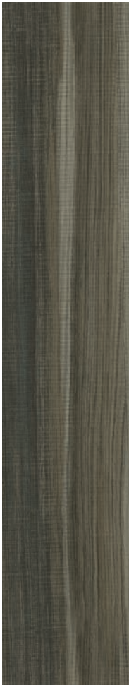
color 1052 compound