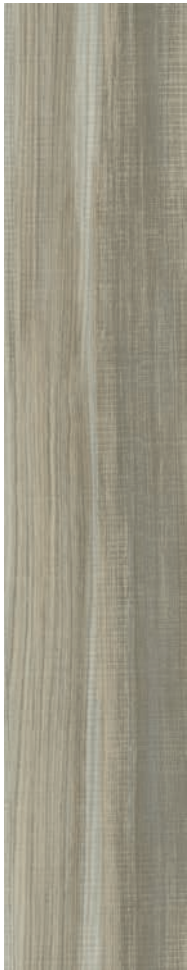
color 1050 union