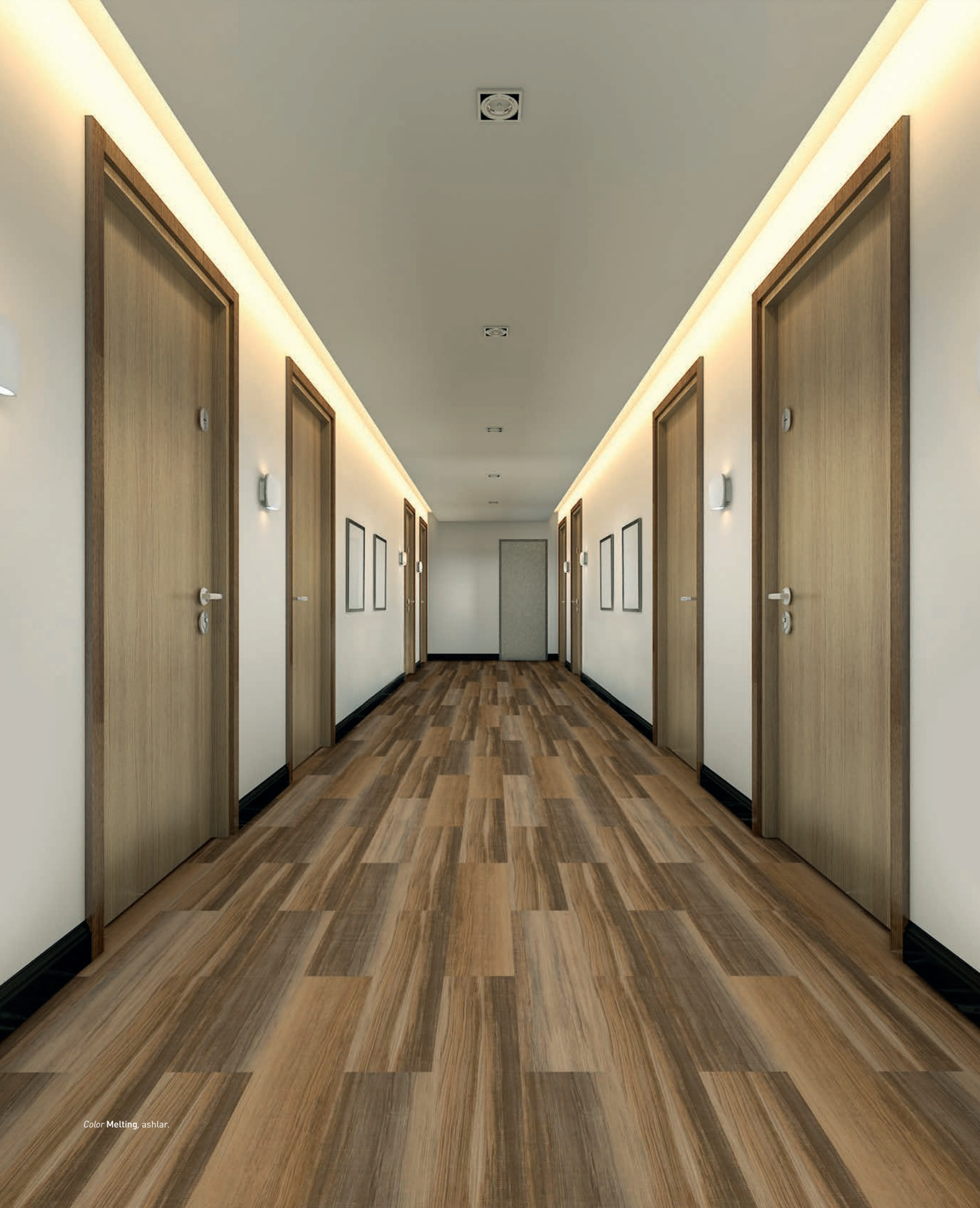
Color Melting, ashlar.