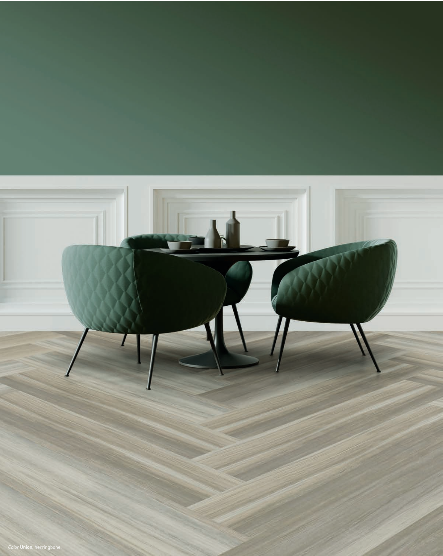
Color Union, herringbone.