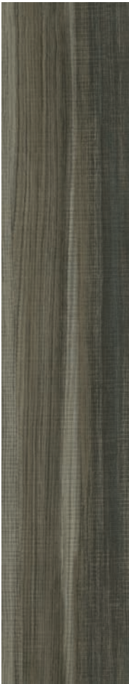
color 1051 blend