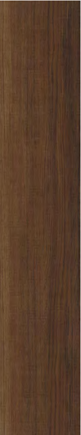
COLOR 1053 intermixture