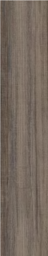
COLOR 1051 blend