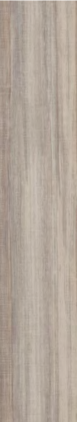
COLOR 1050 union