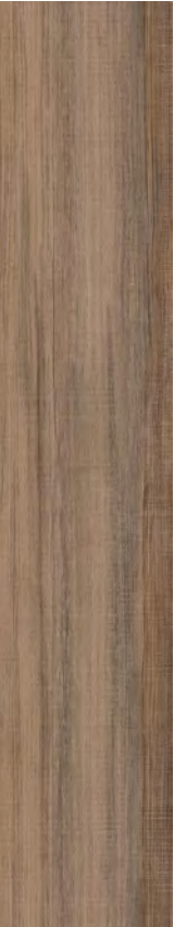
COLOR 1054 melting