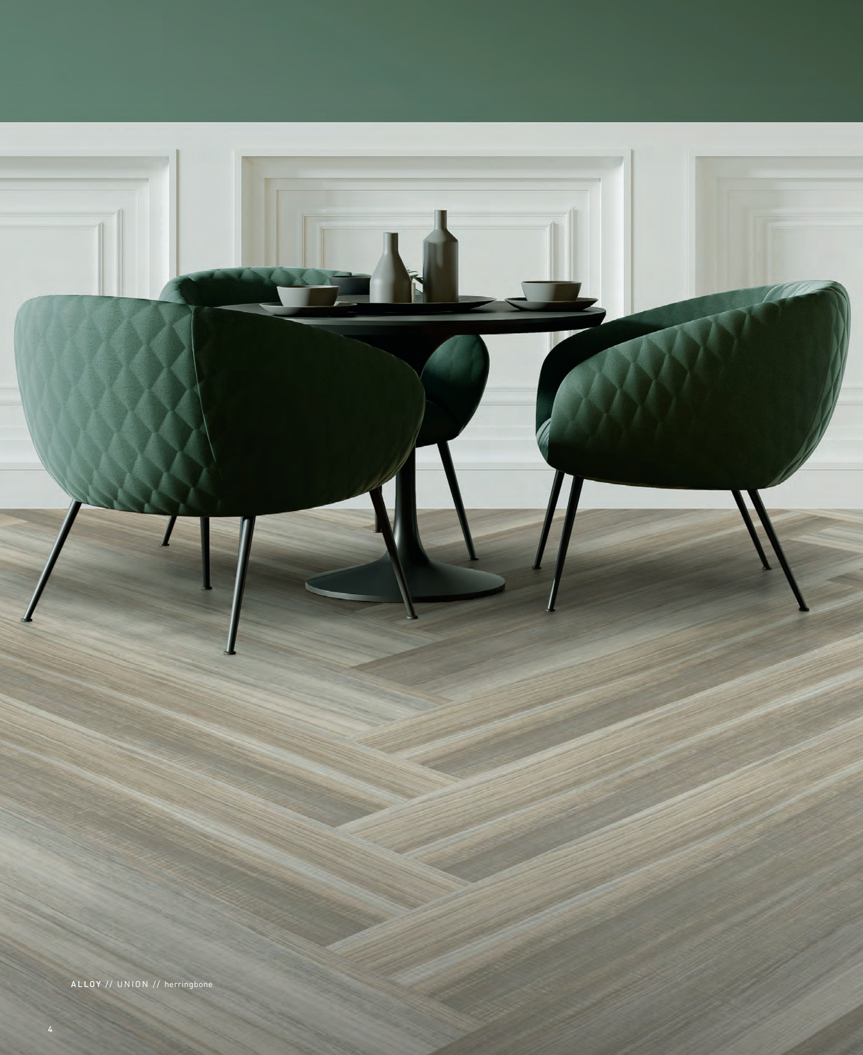
ALLOY // UNION // herringbone