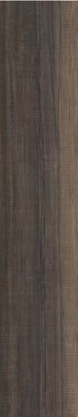
COLOR 1052 compound