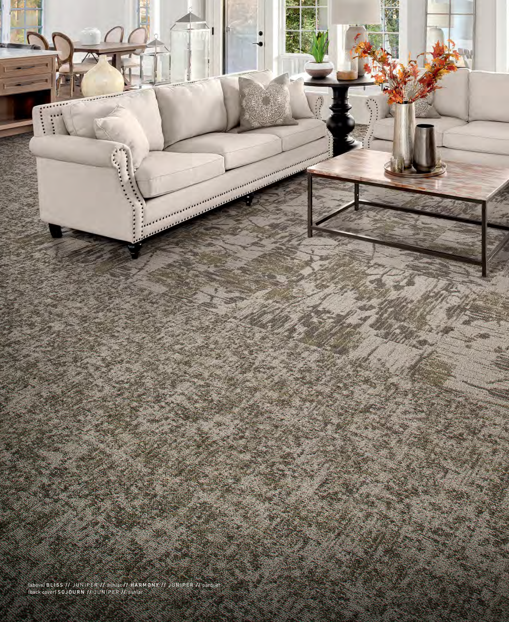
[above] BLISS // JUNIPER // ashlar // HARMONY // JUNIPER // parquet [back cover] SOJOURN // JUNIPER // ashlar