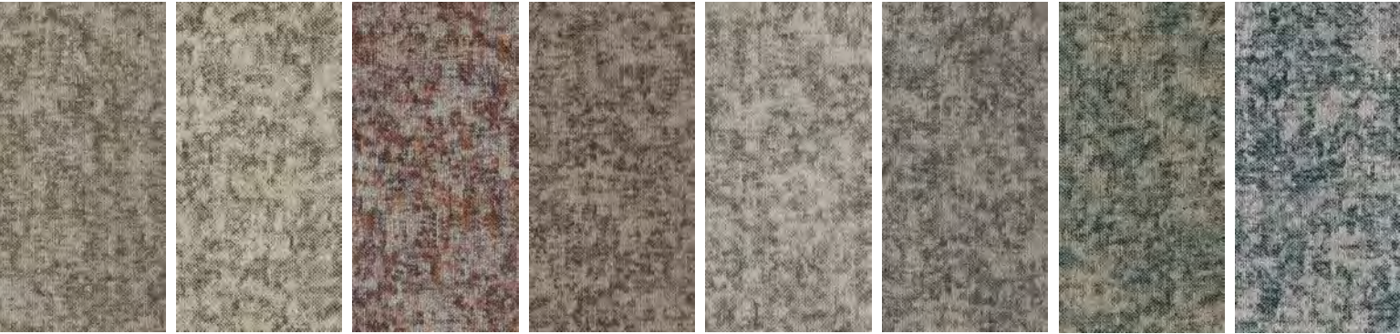
BLISS COLOR 3641 juniper BLISS COLOR 3642 hazelwood BLISS COLOR 3643 alpenglow BLISS COLOR 3644 hearth BLISS COLOR 3645 sandstone BLISS COLOR 3646 crisp air BLISS COLOR 3647 blue spruce BLISS COLOR 3648 wild indigo