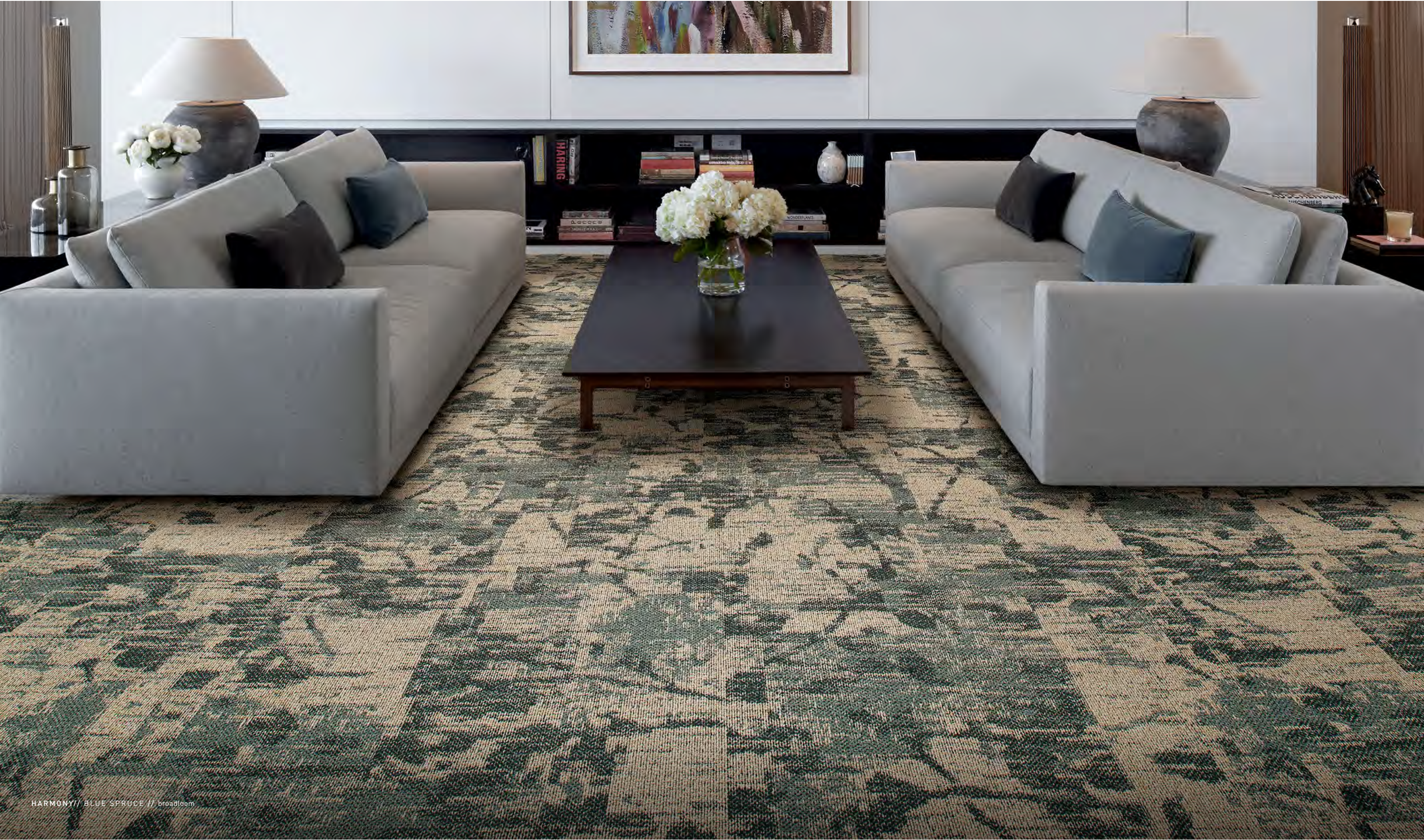
HARMONY// BLUE SPRUCE // broadloom