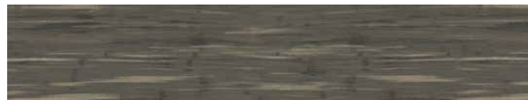
color 1029 annie