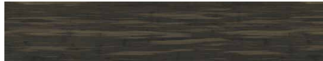
color 1026 eileen