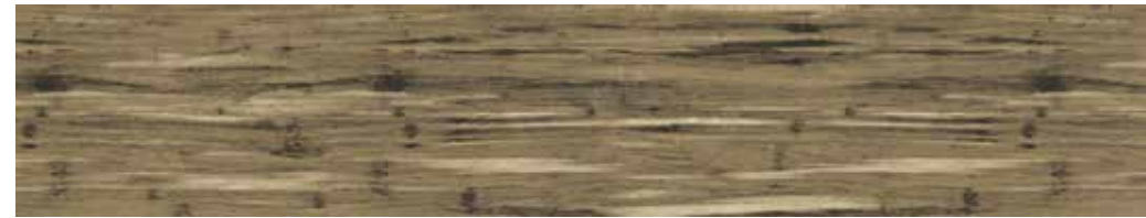
color 1024 charles