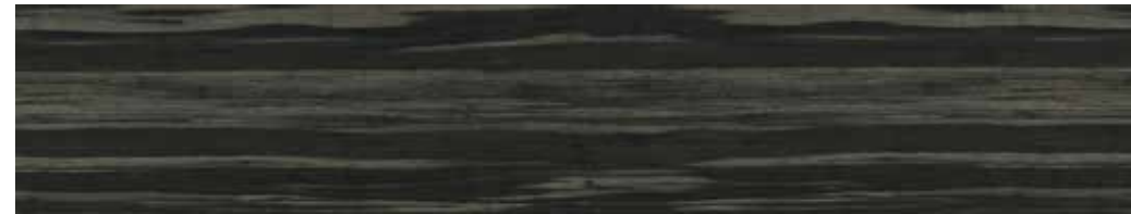
color 1025 george