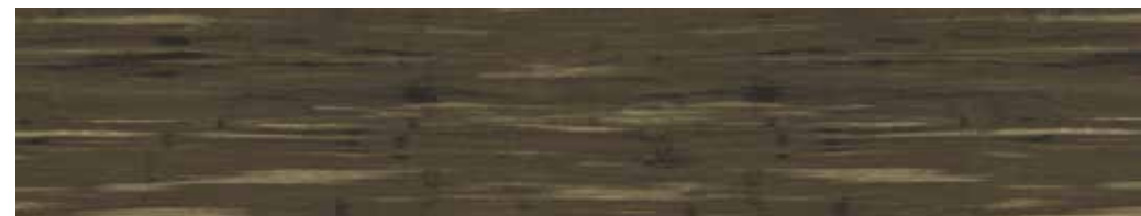
color 1027 hans