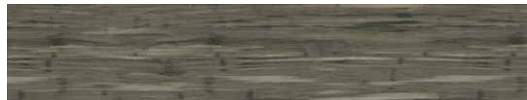
color 1028 piet