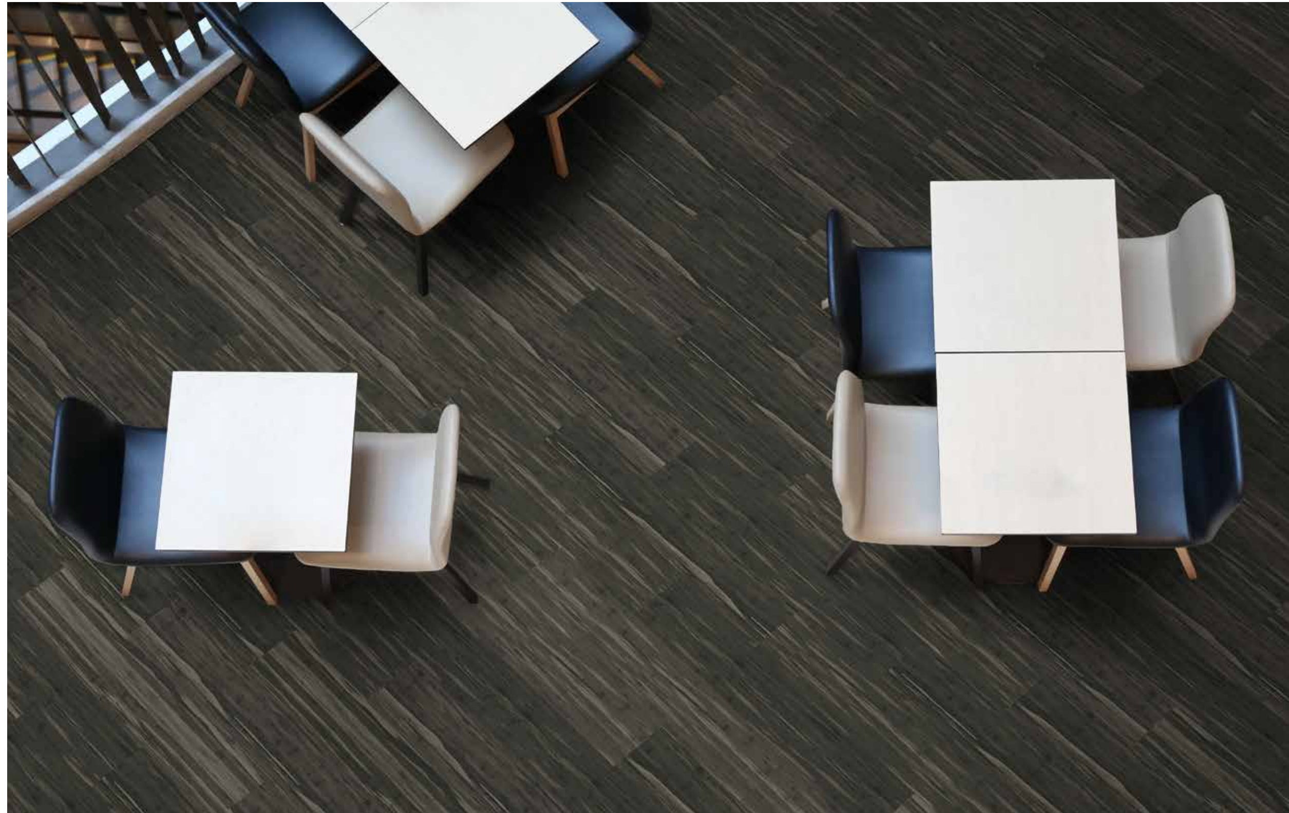
[right] Modern Classics Annie and Piet , third-drop.

For heavy rolling traffic, J+J LVT features the option to wet-set the installation, allowing for a strong and stable adherence and eliminating the need for two-part epoxy.