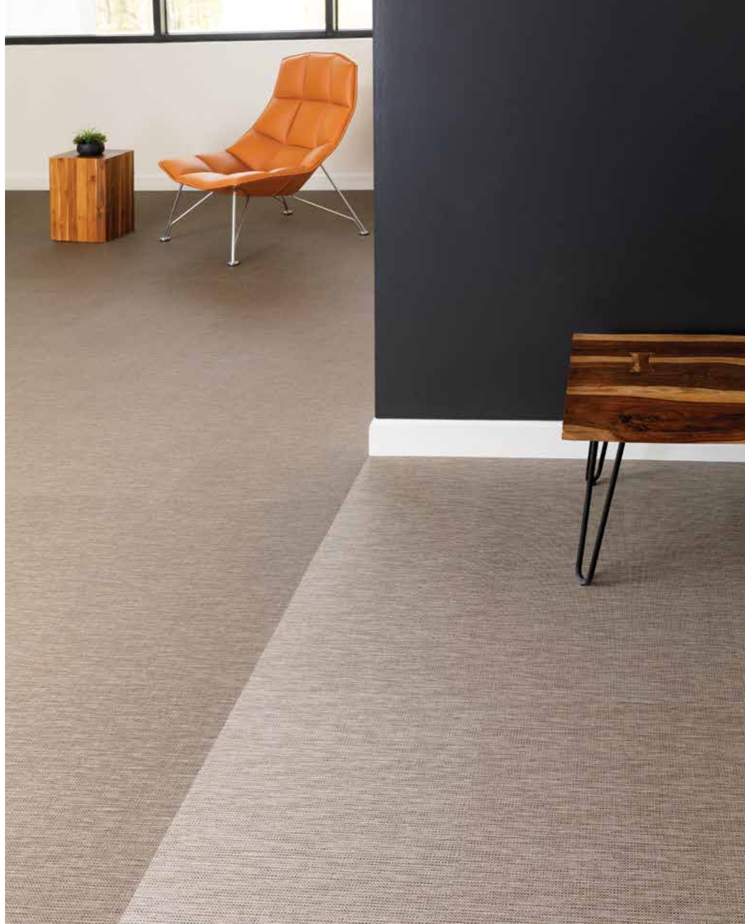
Tatami Straw and Rush, monolithic.