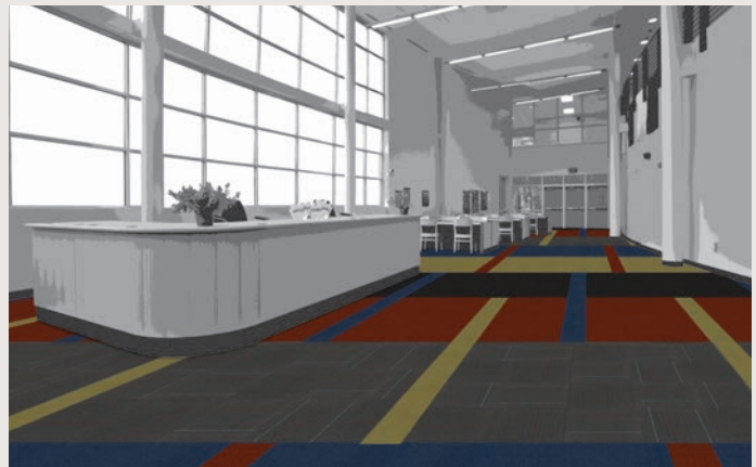
Project rendering created by J+J Flooring Group.