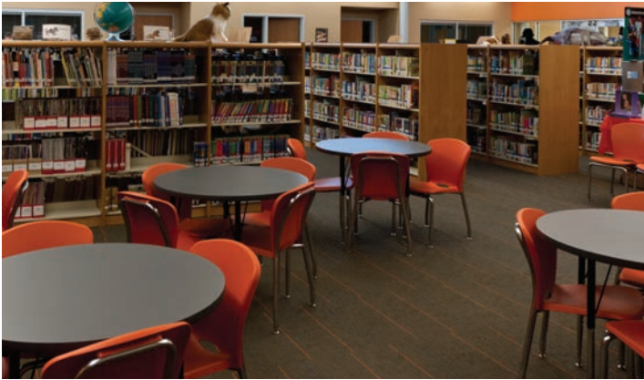
Invision - Maché Trace

The two design firms developed a concept that used the floor to create color identities specific to grade level. Four accent colors, combined with a common pattern of base colors, served as the theme that united the school while creating clearly defined areas. Common areas are accented with orange, while blue marks the Pre-K through first grade spaces, green marks the second and third-grade areas, and fourth and fifth-grade spaces utilize red. Linear products and patterns reinforce the primary North/South axis. The firms selected J+J Flooring Group's Invision modular carpet with a dynamic color palette to contribute to ease of maintenance over the building's life cycle.