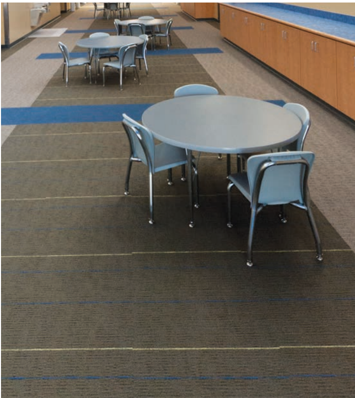
Invision - Maché, Maché Trace, Pulp