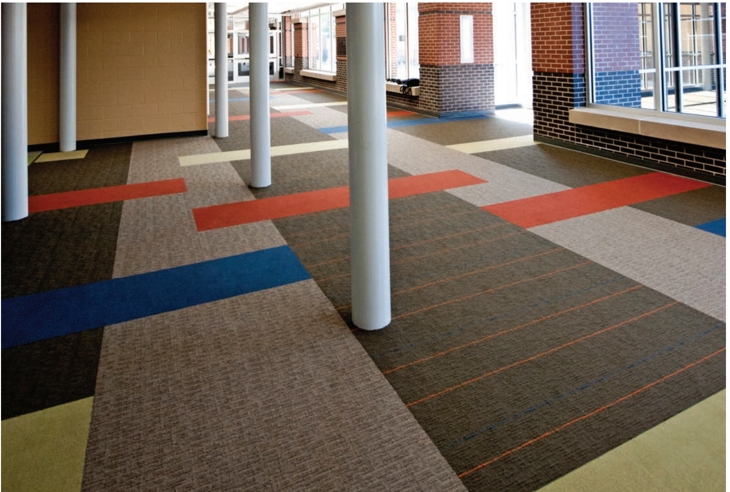
Invision - Maché, Maché Trace, Pulp