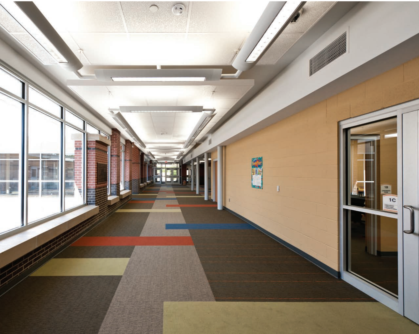
Invision - Maché, Maché Trace, Pulp