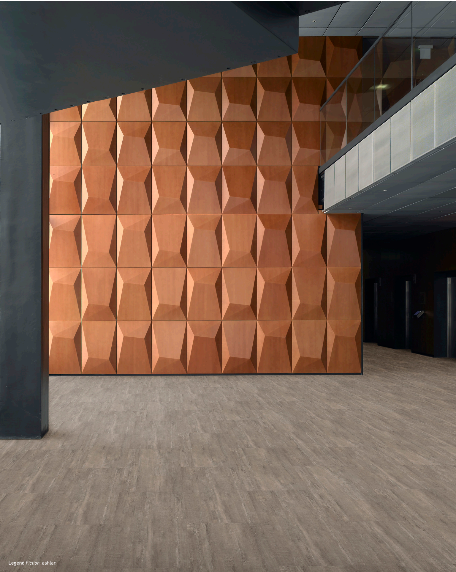
Legend Fiction, ashlar.