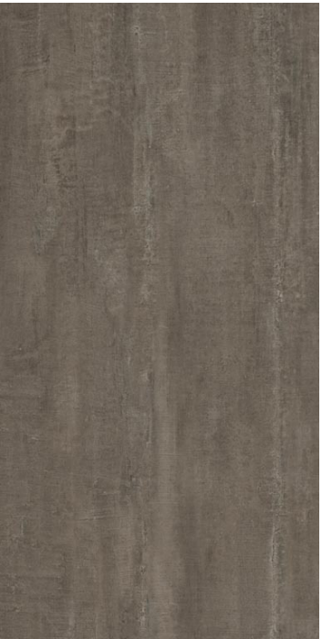
style V5010 color 1057 tale