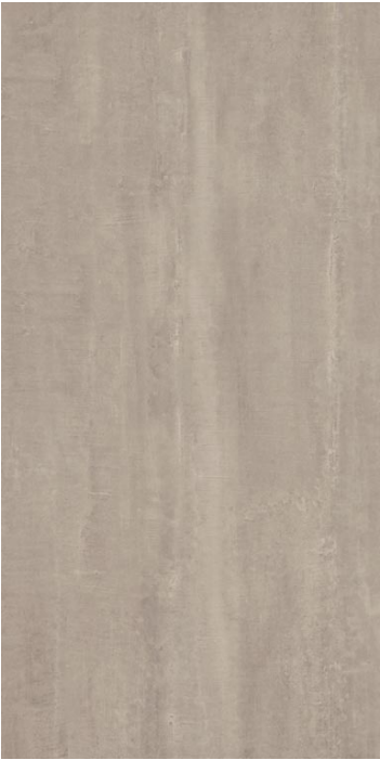
style V5010 color 1055 saga