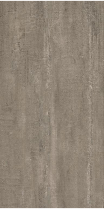
style V5010 color 1059 fiction