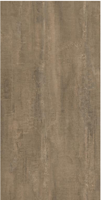
style V5010 color 1056 epic