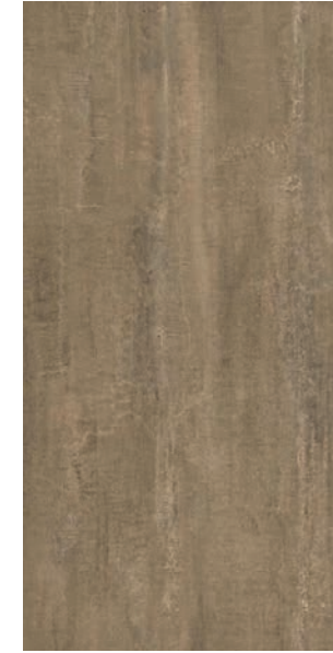
COLOR 1056 epic