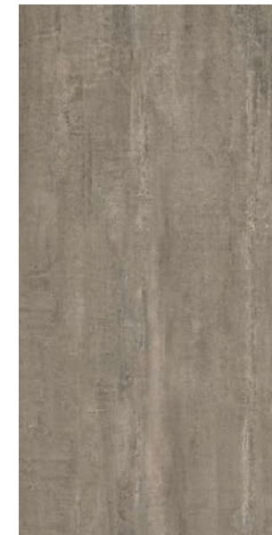
COLOR 1059 fiction