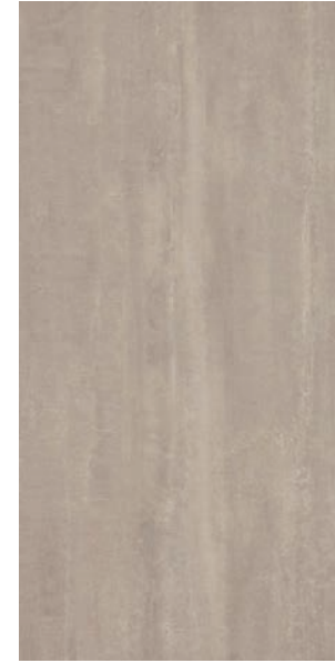
COLOR 1055 saga