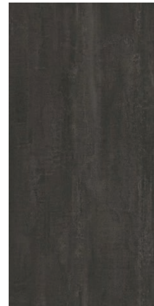
COLOR 1058 fable