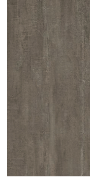
COLOR 1057 tale