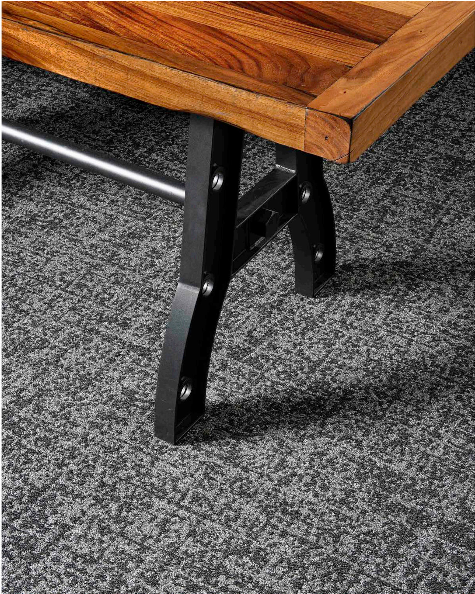
Metamorphic Soapstone, monolithic.