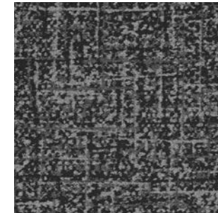
style 7717 color 2965 quartz