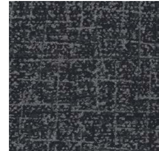
style 7717 color 2962 gneiss