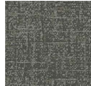
style 7717 color 2966 marble