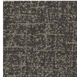
style 7717 color 2963 dolostone