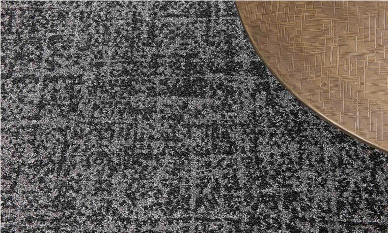
Metamorphic Soapstone, monolithic.