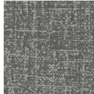
style 7717 color 2959 limestone