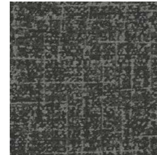
style 7717 color 2964 slate