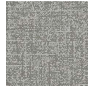
style 7717 color 2968 talc