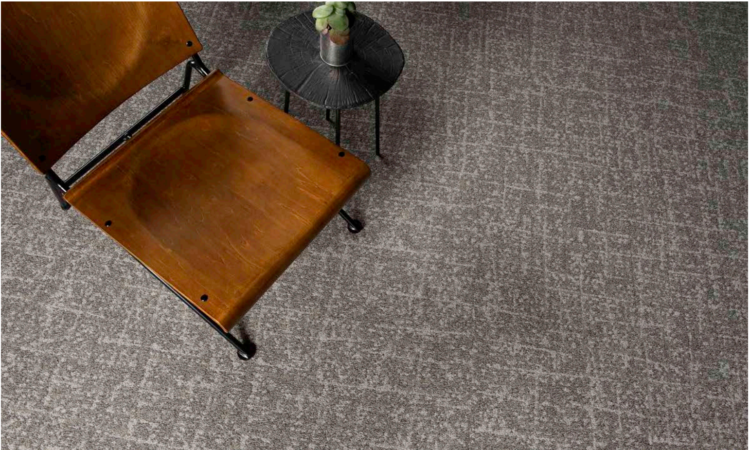
Metamorphic Feldspar, monolithic.