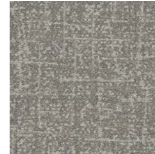
style 7717 color 2960 feldspar