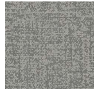
style 7717 color 2969 sandstone