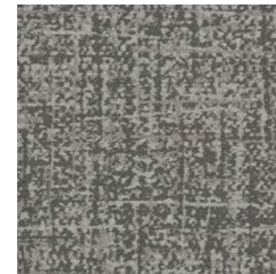
style 7717 color 2967 shale