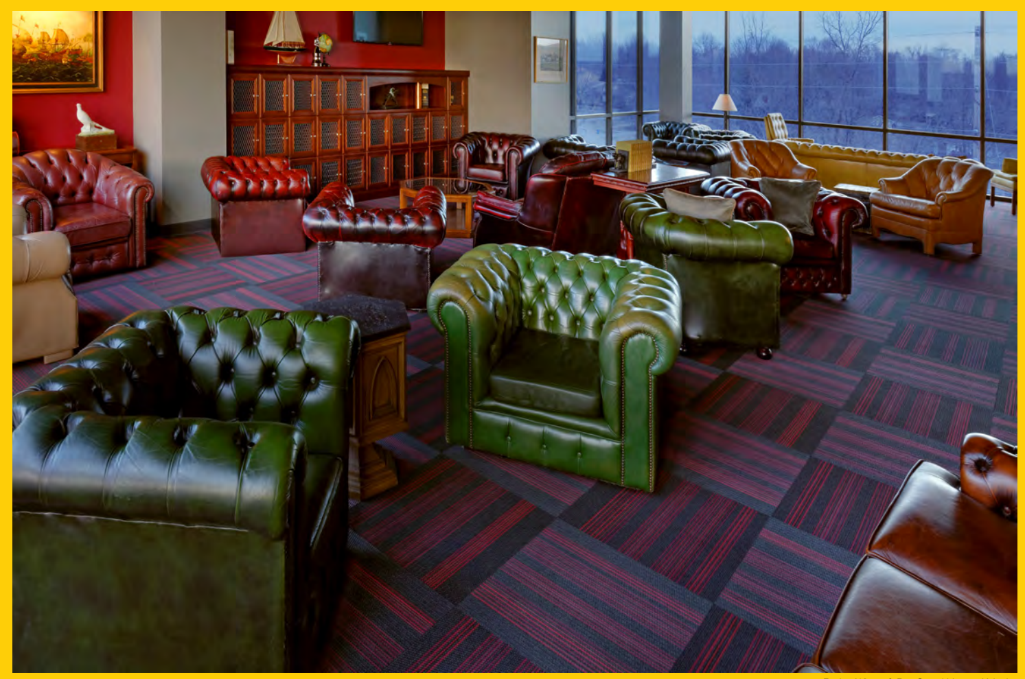
Barley, Wheat & Rye Social House, Velocity