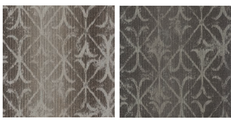
COLOR 3236 COLOR 3237 sandstone smoke