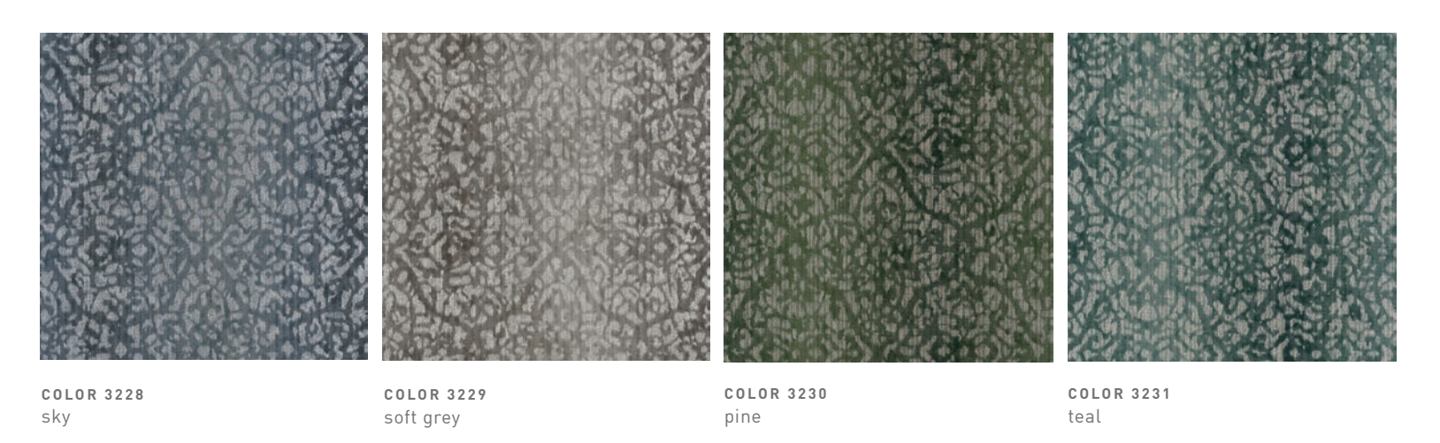
Serene 24"x24" MODULAR + BROADLOOM