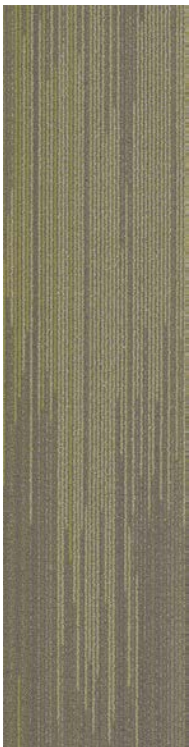
COLOR 3074 myth