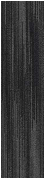
COLOR 3004 afterword