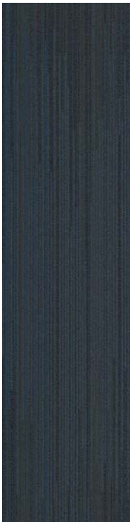
COLOR 2998 epilogue