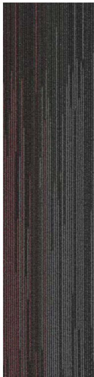
COLOR 2996 forward