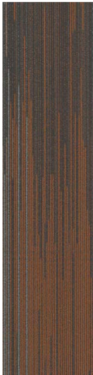
COLOR 3000 folio