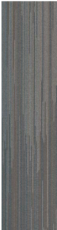
COLOR 2999 prologue