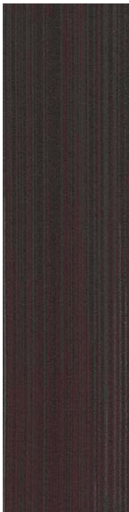
COLOR 2995 edition