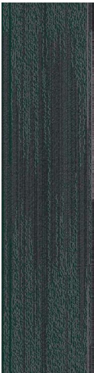
COLOR 3073 haiku