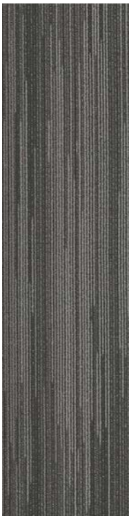
COLOR 3003 title