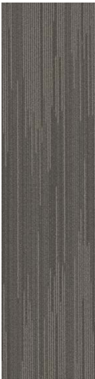
COLOR 1780 cliff-hanger