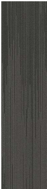
COLOR 1782 harmony