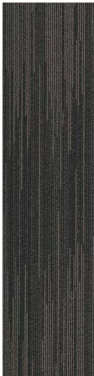
COLOR 1783 tribute