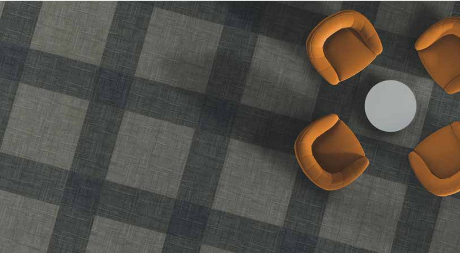
(above) One Good Turn Turn the Tide, Turn Heads and Turn of Events , monolithic. (right) One Good Turn Turn of Events . (page 5) One Good Turn Turn the Tables .