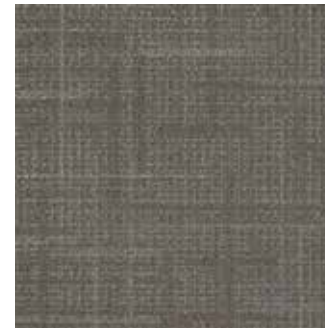
style 7075 2461 turn the page