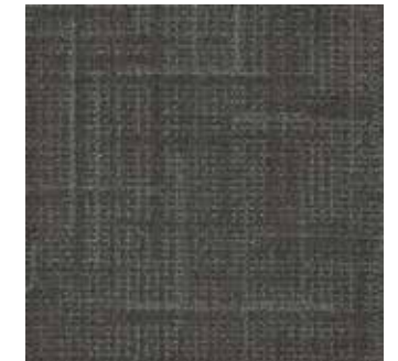
style 7075 2464 turn the tide