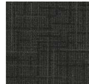
style 7075 2467 turn of events