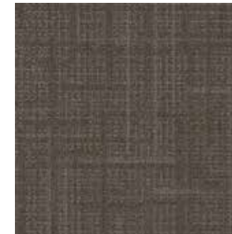
style 7075 2462 turn the corner