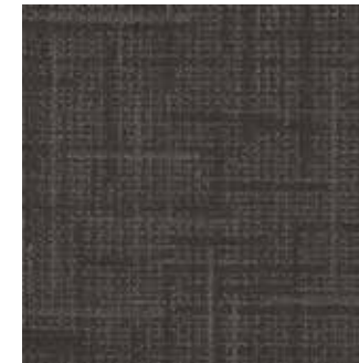
style 7075 2463 turn the tables