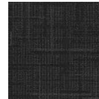
style 7075 2466 turn heads