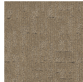
COLOR 3327 mixer