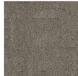
COLOR 3329 stage