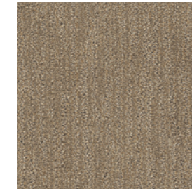
COLOR 3327 mixer