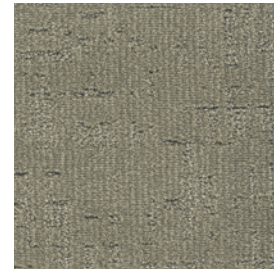
COLOR 3325 aria