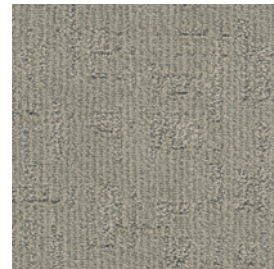
COLOR 3328 solo