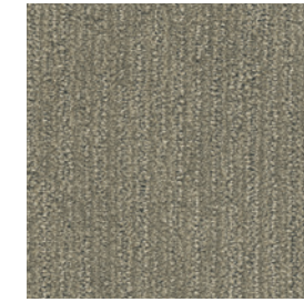
COLOR 3325 aria