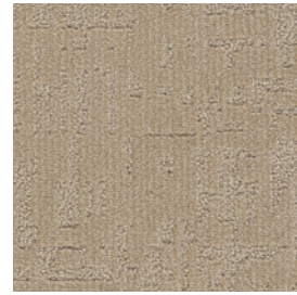
COLOR 3326 cue