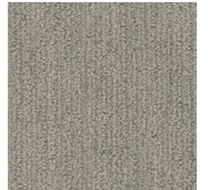
COLOR 3328 solo