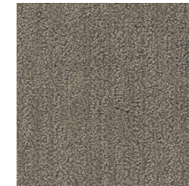
COLOR 3329 stage