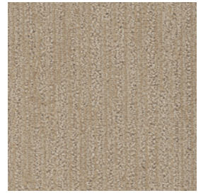
COLOR 3326 cue