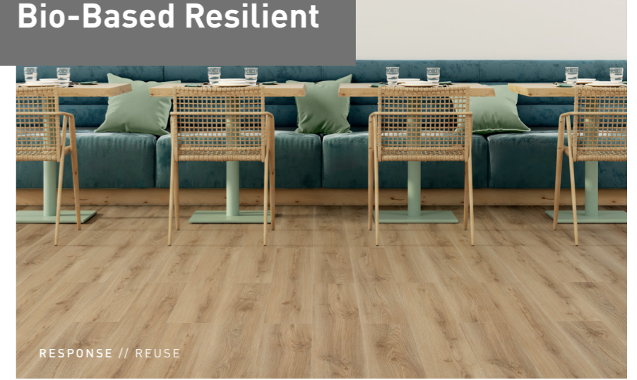
RESPONSE // REUSE

Our bio-based resilient products are a heterogeneous commercial rated polyurethane flooring made from natural ingredients and manufactured in an ecologically responsible factory. It's a sustainable, high-performance composite material produced from plant-based oils such as canola and naturally occurring mineral components like chalk and does not contain chlorine, plasticizers, solvents, harmful pollutants, or phthalates.