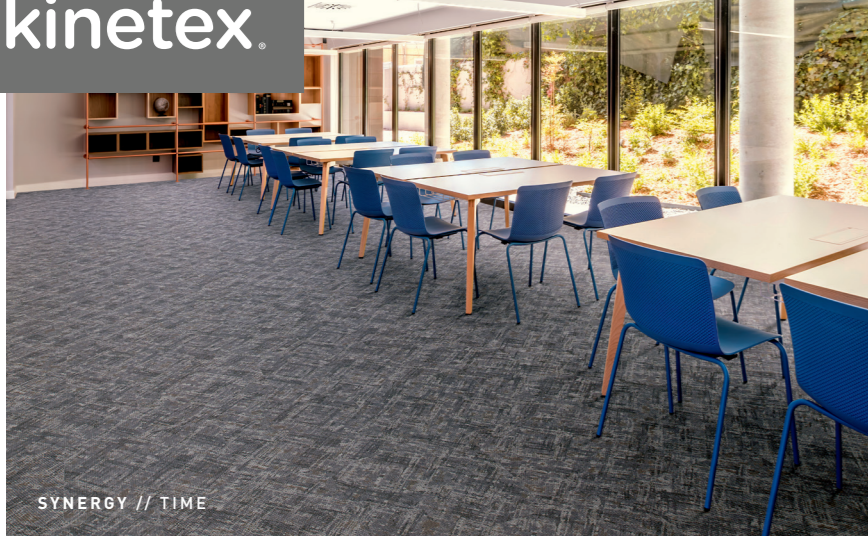
SYNERGY // TIME

Kinetex is one of the most durable soft-surface flooring products on the market. It contains no less than 45% post-consumer recycled content. One box of Kinetex contains the equivalent of 492 plastic water bottles, with one 24" x 24" tile equaling 27 plastic bottles. And with its lower mass, Kinetex has a 50% lower environmental impact compared to other commercial floorings.