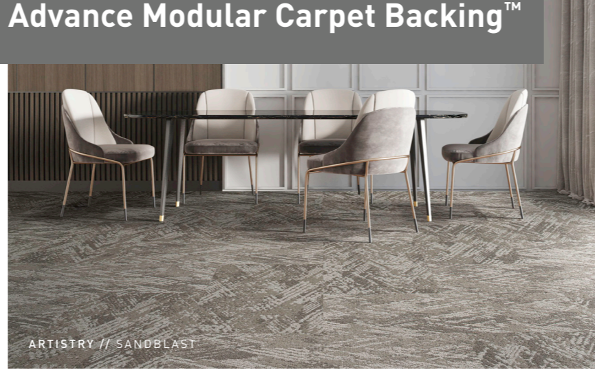
ARTISTRY // SANDBLAST

Advance Modular Carpet Backing™ is PVC-free and is engineered to provide outstanding performance, protection and stability that is required of modular carpet systems. This backing, paired with our broad range of modular carpet designs, provides you with higher performance and appealing design. Other PVC-free options include our Nexus Cushion modular backing and all broadloom backing options.