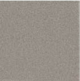
COLOR 9925 talus