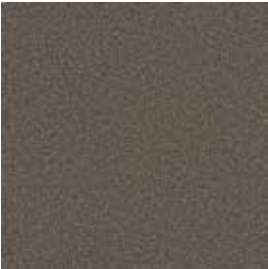
COLOR 9945 dome