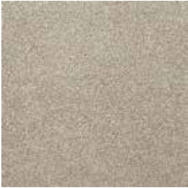
COLOR 9792 sky