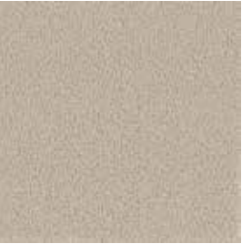
COLOR 9930 slope