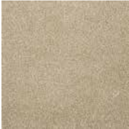
COLOR 9791 frost