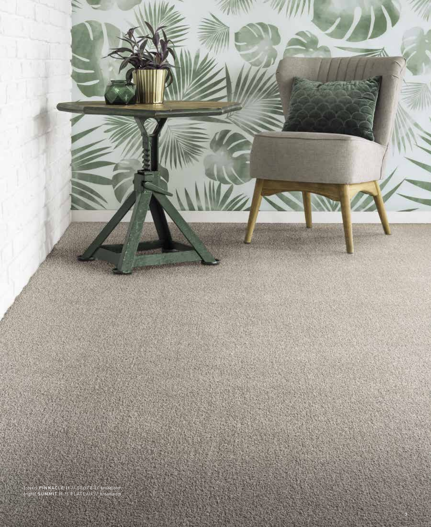
(cover) PINNACLE II // SLOPE // broadloom (right) SUMMIT II // PLATEAU // broadloom

INSPIRATION Good room design promotes a positive mood – a cozy nook you look forward to relaxing and retreating to - a place you can unwind in. Pinnacle II and Summit II were designed to meet the need for warm, welcoming spaces with soothing colorways and plush textures that create a calming and serene residential retreat.