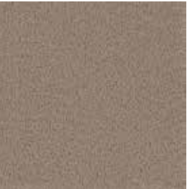
COLOR 9969 point

PINNACLE II // MEADOW // broadloom TATAMI // RUSH // parquet