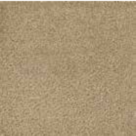
COLOR 9810 meadow