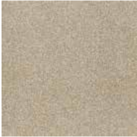
COLOR 9785 limestone