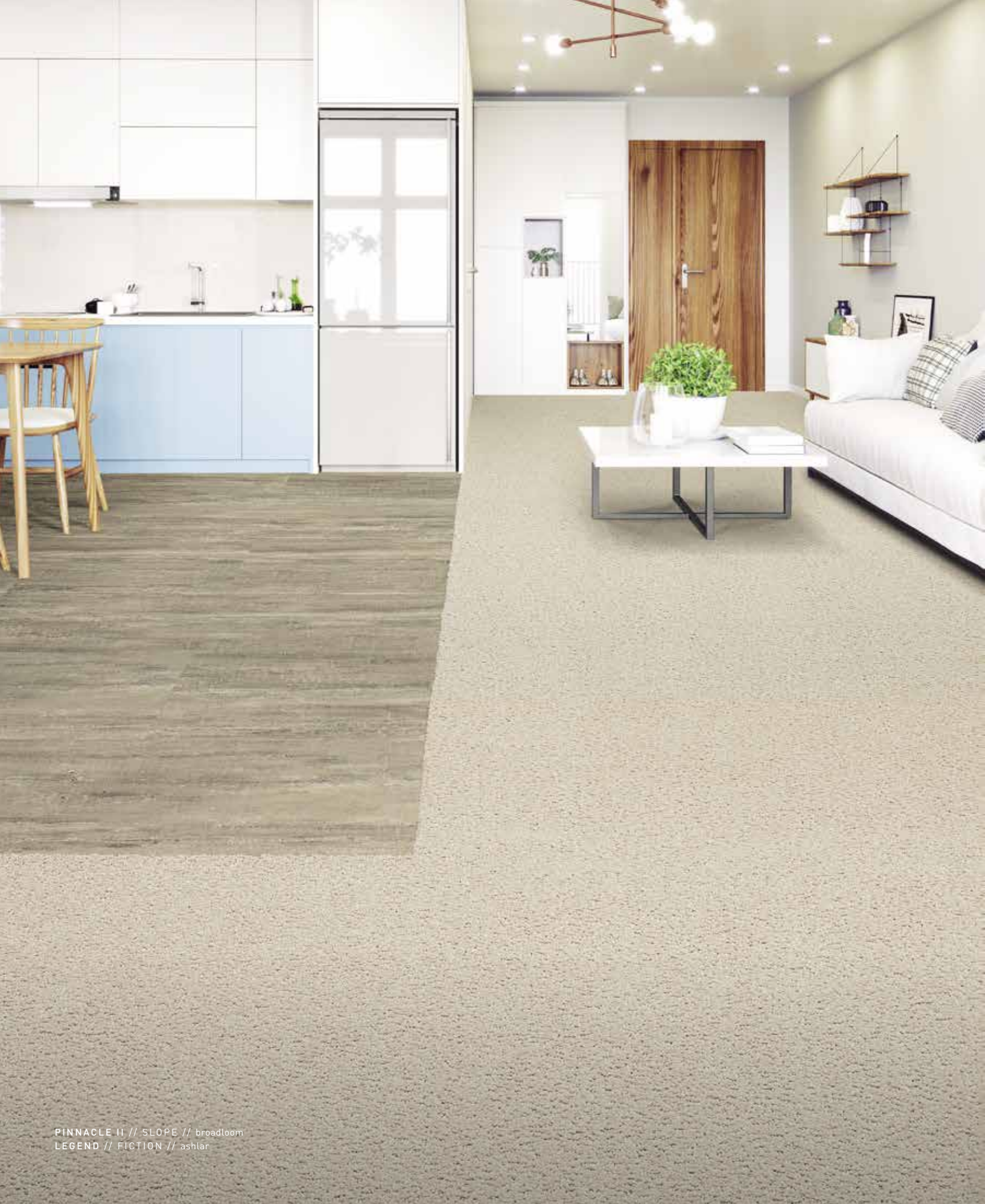
PINNACLE II // SLOPE // broadloom LEGEND // FICTION // ashlar