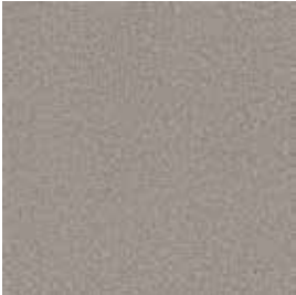
COLOR 9925 plateau