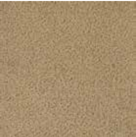
COLOR 9779 canyon