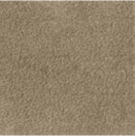
COLOR 9858 granite