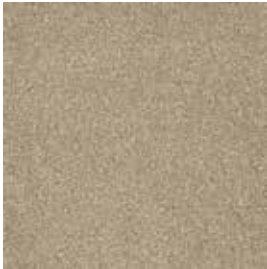
COLOR 9770 peak