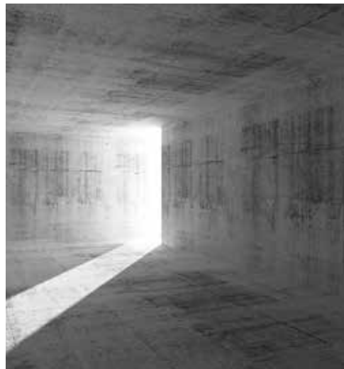
(top) Skyline Overlook , non-directional with Index Volume . (right) Elevated Overlook and Vista , monolithic.