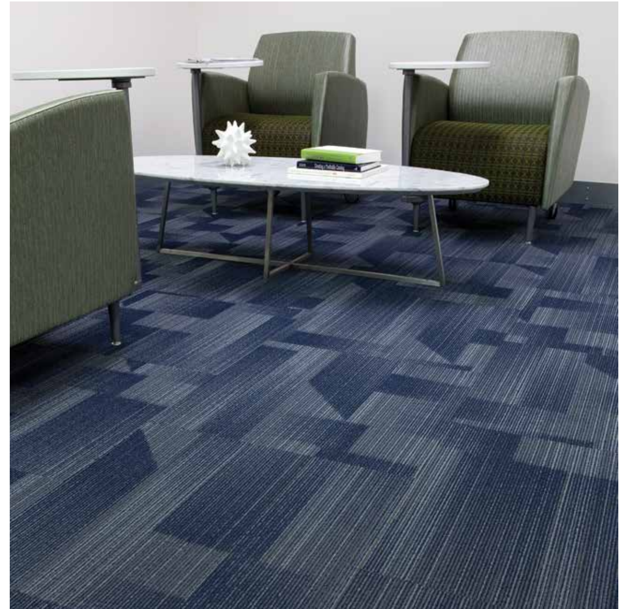
(above) Skyline Vanishing Point , ashlar. (left) Skyline Zenith , non-directional.