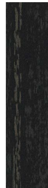
style 7589 color 3014 point of view