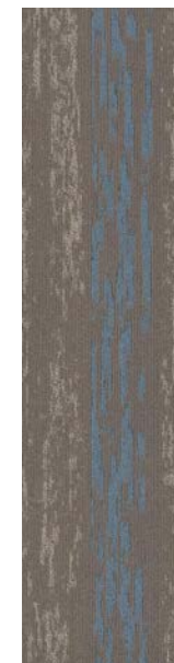
style 7589 color 3009 poem