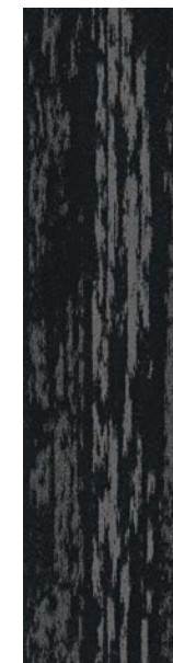
style 7589 color 3016 context