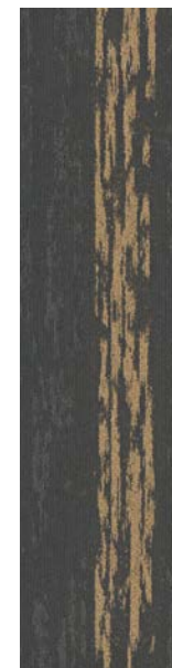
style 7589 color 3007 genre