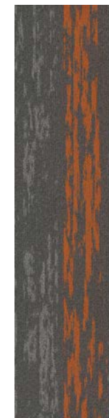
style 7589 color 3010 antagonist