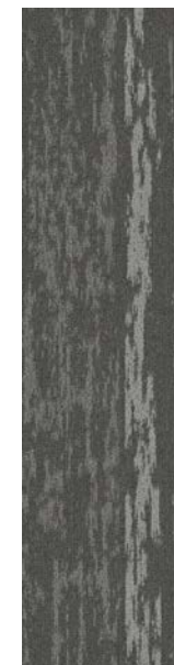
style 7589 color 3015 analogy