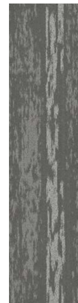
style 7589 color 3013 plot twist