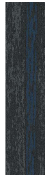
style 7589 color 3008 prose