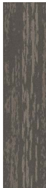
style 7589 color 3011 protagonist