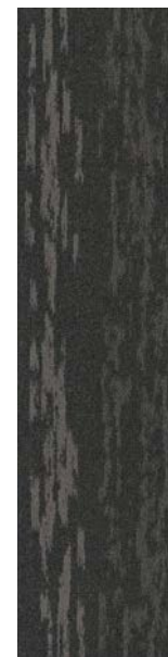
style 7589 color 3012 narration