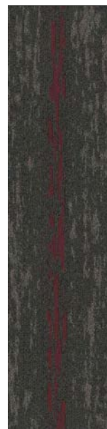
style 7589 color 3005 drama