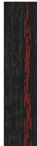
style 7589 color 3006 action